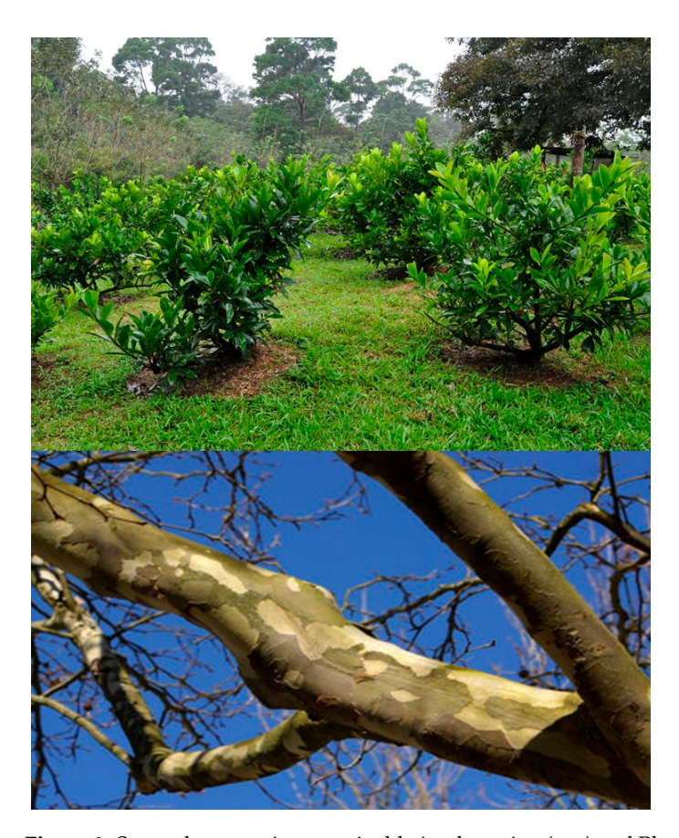
Figure 2. Souroubea growing sustainably in plantation ( top ) and Platanus tree trunk showing peeling bark which is harvested without harming the tree ( bottom ).

Efficacy of the Souroubea-Platanus tablets in reducing anxiety in dogs was assessed in a blinded, placebo-controlled, noise-induced anxiety model. Sixty beagle dogs were assigned into six experimental groups, each receiving: placebo, 0.5 \times , 1 \times , 2 \times , or 4 \times the recommended dose, or the positive control (diazepam). Treatments were administered once daily for five days (the 4 days prior to and the day of testing) prior to the thunderstorm anxiety test. Dogs were tested for changes in blood cortisol levels and objective measures of behavioral activity in response to the recorded intermittent thunder.