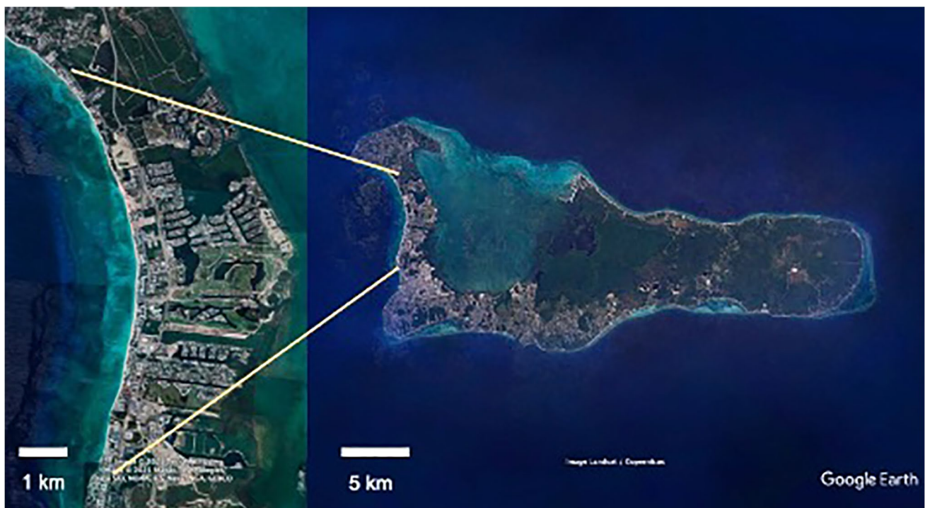
Fig. 2 Morphology of Grand Cayman (main figure) and detail of Seven Mile Beach

The Cayman Islands are a self-governed UK overseas territory, with the Government operating under the framework of democratic governance through a parliamentary system. Executive power is exercised by the Government consisting