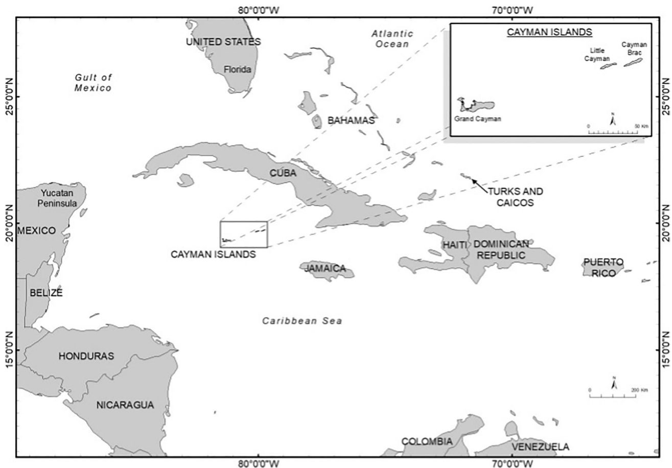
Fig. 1 Locality Map showing situation of Cayman Islands (inset)

The Cayman Islands (Fig. 1) comprise three islands (Grand Cayman, Cayman Brac and Little Cayman) and are part of the Greater Antilles chain, located in the north-western Caribbean Sea ( 19^{\circ} N 81^{\circ} W). Totalling only 164 km 2 , these low-lying islands represent peaks of the Cayman Ridge