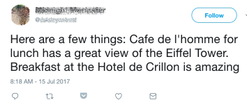
Figure 1: Tweet containing review-like data

can be exploited in other tasks, like query expansion, item recommendations, or user modelling. We define the experimental scenario in detail, and explain how we capture contextual information related to entities/events, in Section 4. We are interested in Twitter data for the unique nature of tweets. People tend to be more spontaneous and immediate on Twitter. They express relatively unfiltered opinions by giving immediate voice to their daily experience. Tweets can often take the form of a “review”, giving an insight into the tweeter’s opinion about what they are interacting with in the real world, be it a restaurant, hotel, TV show, celebrity etc. Tweets like the one in Figure 1 provide potentially valuable information about the hotels mentioned and their relationship to the Eiffel Tower, which is different from other on-line reviews (ratings/comments).