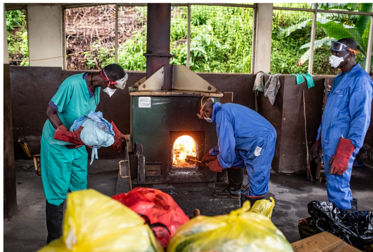
Fig. 4 Incinerator room in government hospital, Freetown Sierra Leone.

[5]. But if the waste management systems that are in place to respond to this increased volume of tests are anything like those that we observed in Sierra Leone in 2019, as is suggested to be the case by WHO reporting and a recent review of waste management systems in 11 African countries [14, 29, 32], then we are heading for a diagnostic waste crisis. This is even more so the case when the additional waste generated by the distribution of personal protective equipment (PPE) and the vaccine rollout is taken into account [3, 7, 9, 22].