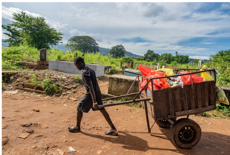
Fig. 1 Waste collector carts medical waste from Community Health Post to public dump, Western Rural Area, Sierra Leone.