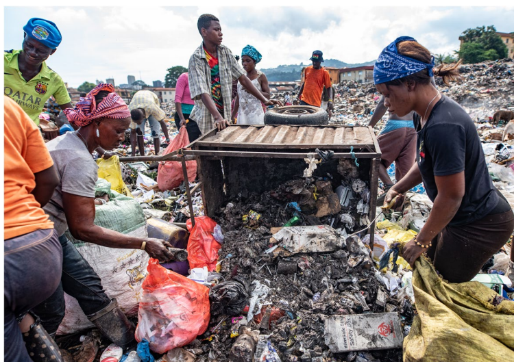
Fig. 2 People at public rubbish dump pick through the medical waste from a Community Health Post (CHC), Western Rural Area, Sierra Leone.

too small to accommodate all the infectious waste generated by the hospital, and the staff burned large volumes of waste in the open area behind the patient wards, which sent up dark plumes of smoke (Fig. 4). Liquid waste was poured down a pipeline that led directly to the public beach, where we also found remnants of other laboratory waste, including needles and test tubes. Unsurprisingly, morale among cleaners and incinerator staff was low. Pay was little, there were few career opportunities, and staff received scant recognition for doing their job well. Cleaners and incinerator staff lacked sufficient or