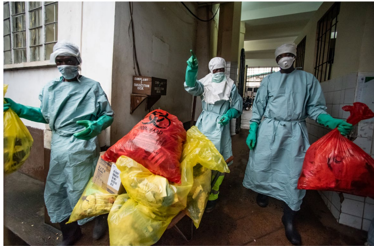
Fig. 3 Cleaner takes wheelbarrow full of hospital waste to the incinerator, Freetown, Sierra Leone.