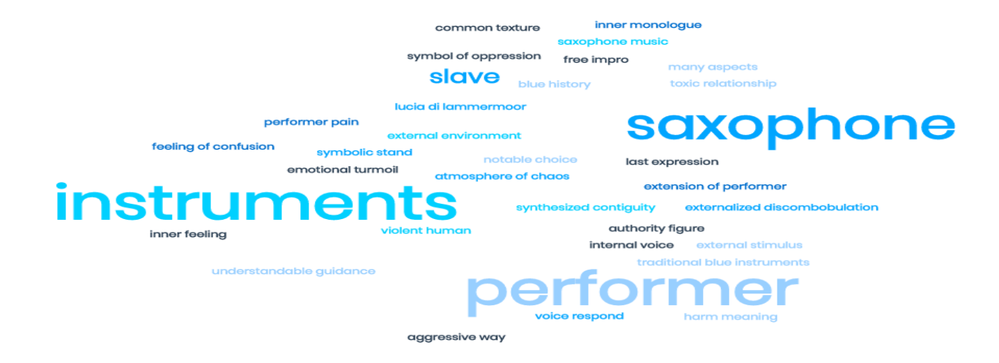
Figure 3: Word Cloud demonstrating the participant's thoughts on the relationship between instrumentalist and performer

pain or otherwise would require further investigation) and that there was some form of opposition between instrumentalist and performer. The word cloud below shows the most used words in response to the question 'in your opinion, what is the relationship between the instrument and the performer in this excerpt?' (Figure 3).