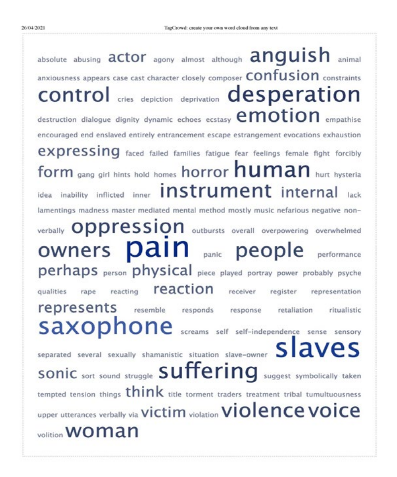
Figure 2: Word Cloud demonstrating the most used words describing what the participants felt about excerpt of SWEET TOOTH (2018).

Participants were then asked about their perception of the relationship between the instrument and the performer. The majority (81.25%) of participants described a reaction between the instrumentalist and performer and how the saxophone appeared to be controlling the performer. Others cited that they felt there was some kind of physical pain (whether empathetic