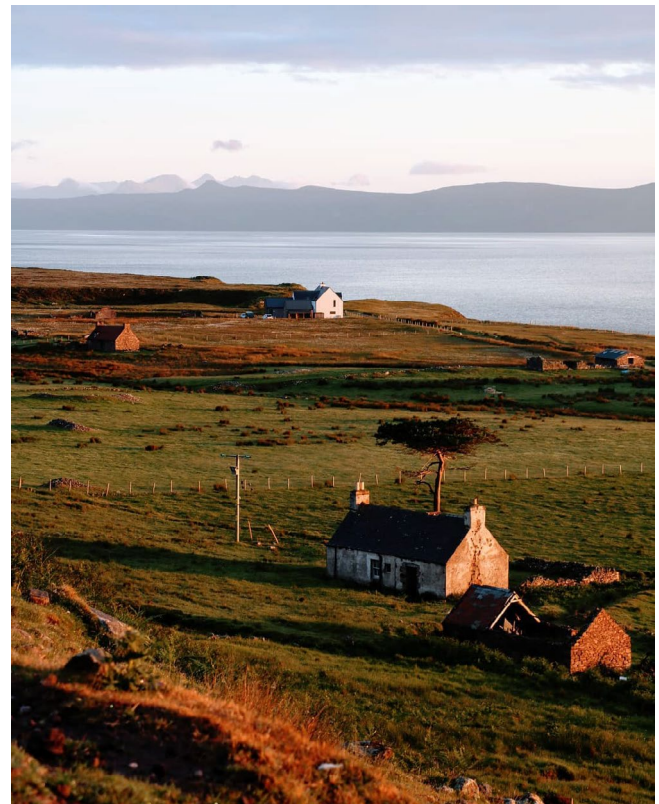
FIGURE 2 Connor's girlfriend's picture, showing houses in Applecross, popular on Instagram

These practices were influenced by previous images of the same place or same activity shared in both mass and social media. Even if