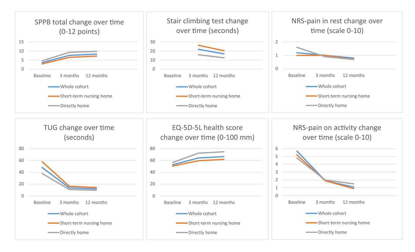
FIGURE 2 Line graphs of physical health outcomes during the first post-operative year in participants with hip fracture

Abbreviations: NRS, Numeric Rating Scale; SPPB, Short Physical Performance Battery; TUG, Timed Up & Go.