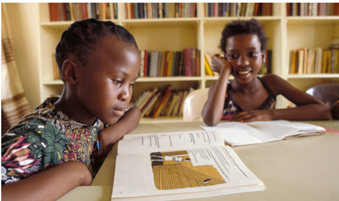
Photo: South Africa. Children reading in class.

The team found that many of the children were not reaching basic levels of reading proficiency. Despite poor reading outcomes, the study showed that instruction in the teaching of reading generally received little attention from leadership and managers; was under-prioritised in professional development; and teachers were unaware of how