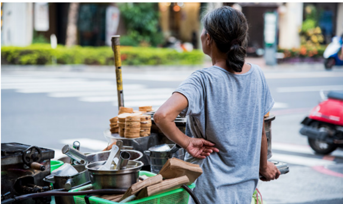
Cover photo: A street vendor waiting to sell her ready-to-eat food.

Between 2016 and 2019, a research team led by Cardiff University collaborated with partners on the ESRC-DFID-funded project 'Economic Recovery in Post-Conflict Cities: The Role of the Urban Informal