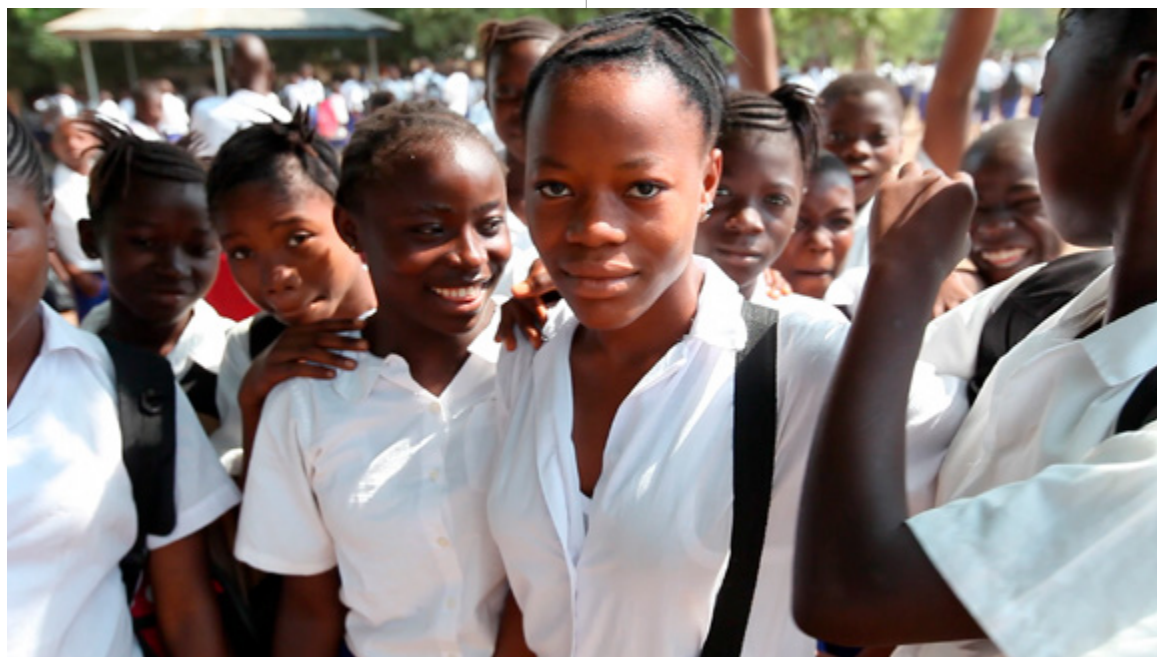
Photo: Girls in a school yard in Sierra Leone.

In 2012 the action research team began working in two districts in Sierra Leone: Moyamba District within the Mende-speaking southern area and Bombali District