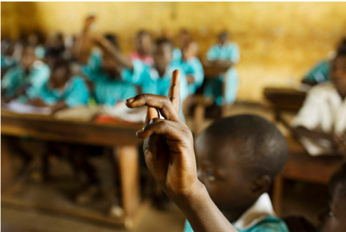
Photo: Uganda Kampangi, Rakai. A pupil holds up their hand to ask a question at St. Henry's school where about 410 students between the ages of 6 and 16 are enrolled.

Funded through the ESRC-DFID Raising Learning Outcomes in Education Systems Research Programme, the aim of the research was to evaluate and measure