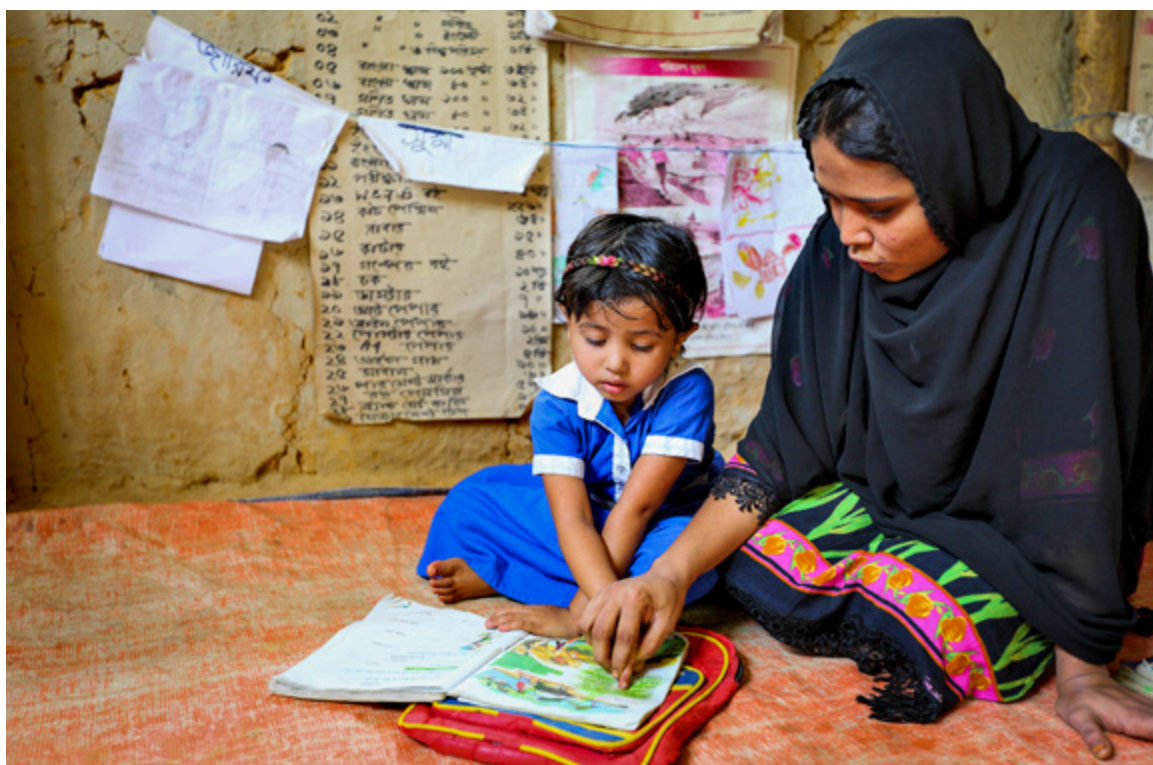
Photo: A young girl reads with her Early Primary Education (EPE) teacher in Bangladesh.

In Bangladesh, many parents, particularly those from rural areas, are unable either to send their child to pre-school or to support his/her development adequately at home. Innovative research from the ESRC-DFID study ' Investing in our future: the early childhood intervention and parental involvement in Bangladesh ' is making a valuable contribution to our understanding of low-cost pre-schooling in remote rural areas.