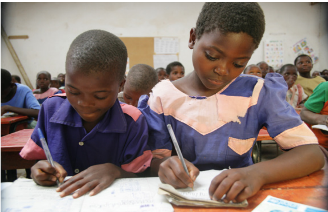
Photo: Malawi. Children studying in class.

The research team wanted to study whether a flexible approach to learning could improve educational achievement and reduce the risk of dropout for vulnerable children. Key components of their ground-breaking SOFIE model included a 'school in a bag' that held pens, notebooks, textbooks and self-study