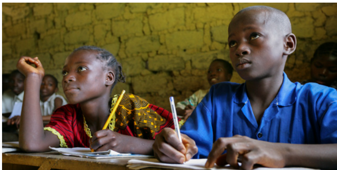
Photo: Pupils in class in Liberia.

Crucially, the results varied by provider: some generated uniformly positive results, while in other cases, there were stark trade-offs between learning