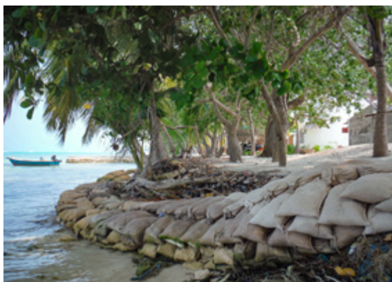
Cover photo: Sandbags piled up to slow down coastal erosion.

Of the 1,200 or so islands that make up the Maldives, around 200 are 'inhabited' with a further 130 'uninhabited' and primarily used as locations for holiday resorts. In recent years, the government has permitted the development of hundreds of guesthouses on the inhabited islands. Being a source of employment and income generation, local people generally support this change; but it has also brought new challenges, in particular a high impact on the environment.