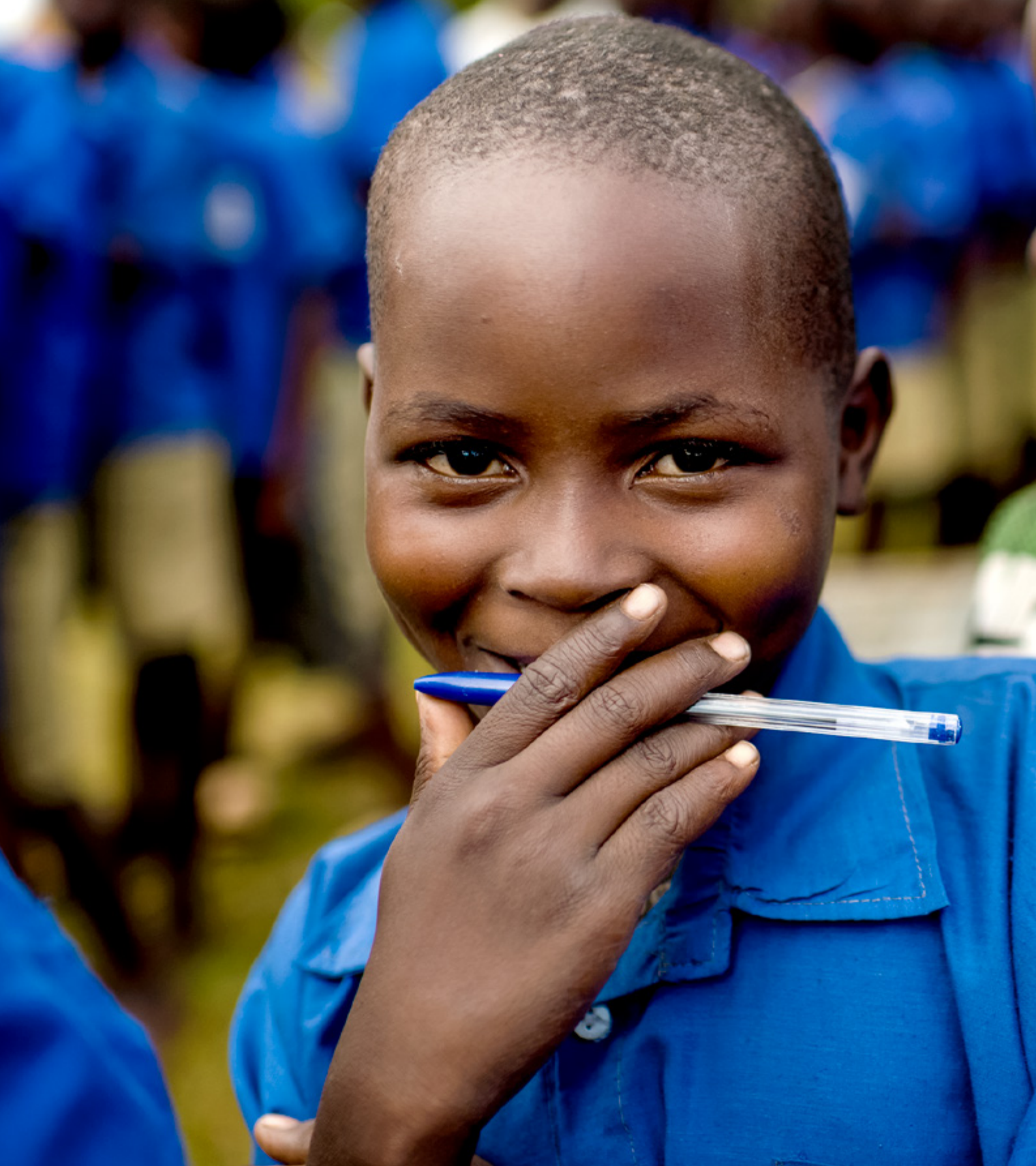
Photo: Tororo, Uganda: A boy giggles during a presentation on menstrual hygiene management at Agwait Primary School.

This research was funded by the UK's Economic and Social Research Council (ESRC) and the former UK Department for International Development which merged with the Foreign & Commonwealth Office on 2 September 2020 to become the Foreign, Commonwealth & Development Office.