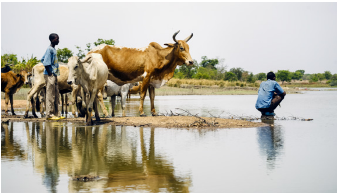
Cover photo: Youths watch over their cattle at a reservoir, often the last water point during the hottest and driest months of the year, Burkina Faso.

The ESRC-DFID-funded project 'Pathways out of poverty for Burkina Faso's reservoir-dependent communities' created Innovation Platforms (IPs) – spaces for face-to-face learning, exchange, and negotiation.