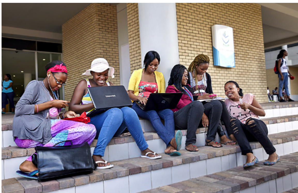
Photo: A group of students sit together outside a University in Botswana. Credit: Marc Shoul/Panos Pictures.

The ‘Pedagogies for Critical Thinking: Innovation and Outcomes in African Higher Education’ project examined the impact of teaching reforms in 14 universities across Botswana, Ghana, and Kenya. Using a mixed methods approach (a longitudinal study of student ‘gains’ in critical thinking over a two-year period and a qualitative investigation of the teaching and learning environment), researchers wanted to understand how different teaching styles affected the development of critical thinking skills,