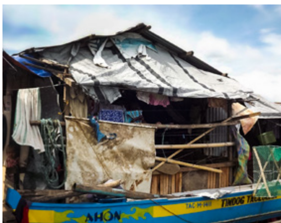
Photo: Communities attempt to rebuild their lives amidst the debris left behind by Typhoon Yolanda.

The researchers carried out 200 interviews with non-governmental organisations (NGOs) and government personnel; held 50 focus groups with local people to discuss their concerns about the rebuilding process; and conducted a documents review. The researchers also