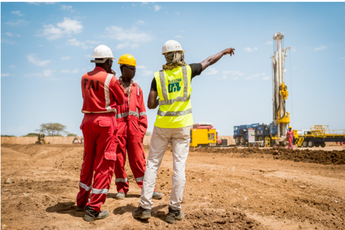
Photo: At a new well pad just north of Lokichar, a rig is positioned to begin drilling.

with them – the greatest in Turkana County’s history. These explorations are set to continue, with the full development of the region’s oil fields estimated to require US$2.9bn (Tullow Oil 2018).