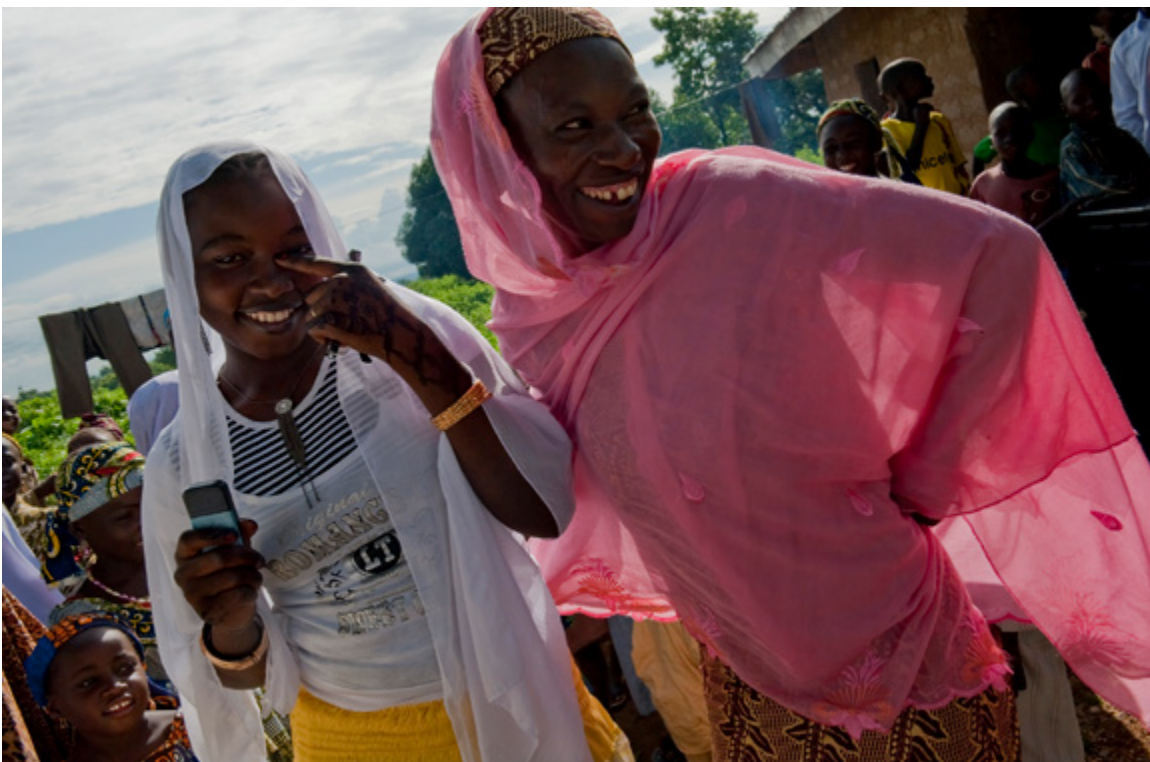
Photo: Women of Takalafiya-Lapai village.

In addition, in sub-Saharan Africa teacher absenteeism in adult education programmes can be a major problem, particularly in remote rural areas. In prior