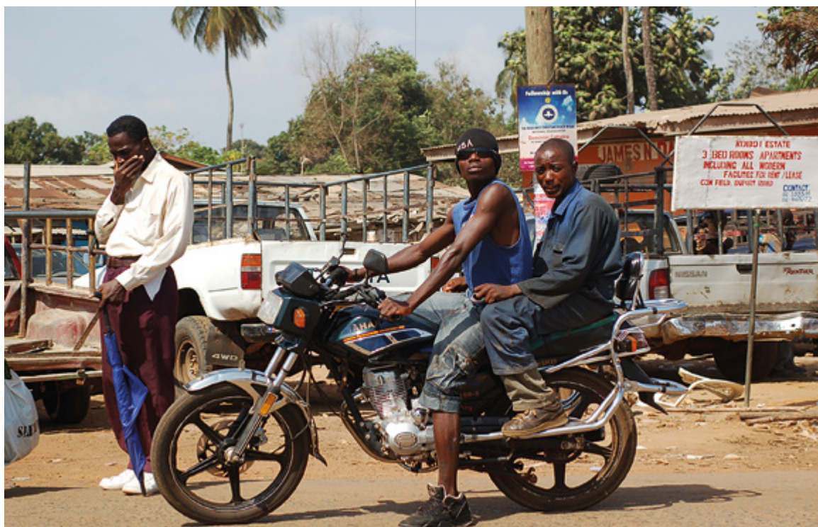
Photo: Motorcycle Taxi.