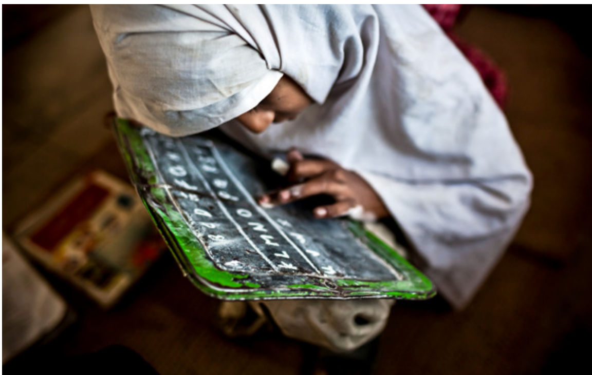
Cover photo: Punjab, Pakistan. A pupil practices her English at a government primary school in the remote Panchkasi village.

In 2014, the ESRC-DFID-funded Teaching Effectively All Children (TEACh) project assessed around 1,600 children aged 8–12 years in rural Central Punjab on literacy and numeracy skills. The researchers combined the Child Functioning Questions developed