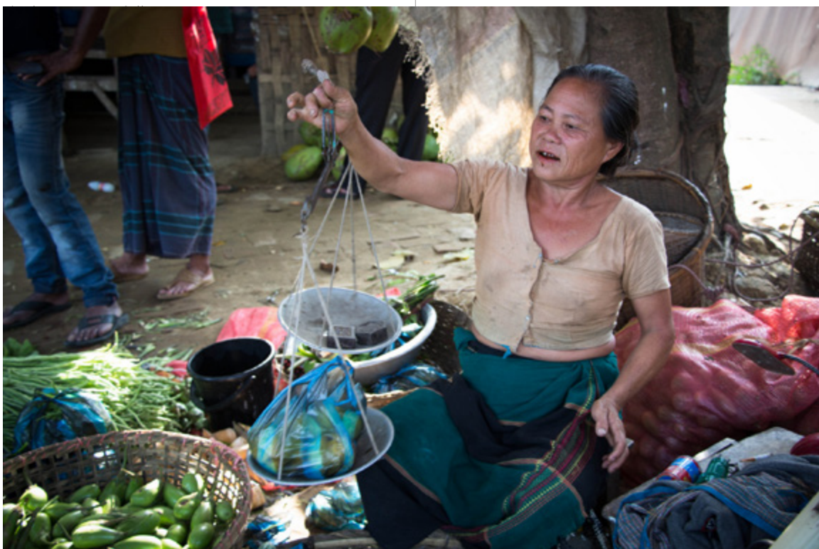
Photo: Measuring vegetables while selling in the market at Khagrachari, Bangladesh.

Through BRAC's Challenging the Frontiers of Poverty Reduction: Targeting the Ultra-Poor (CFPR-TUP) programme, over 650,000 ultra-poor families have graduated from poverty since 2002. This programme worked on the logic that those living in extreme poverty needed some kind of 'asset transfer'. Since most were illiterate they required training to take care of their 'business' assets – i.e. a cow, a flock of chickens, or a small grocery shop. That logic extended to the understanding that in order to benefit from having these assets the families have to be well looked after. Each family was provided with a case worker who gave not only practical guidance but also emotional support.