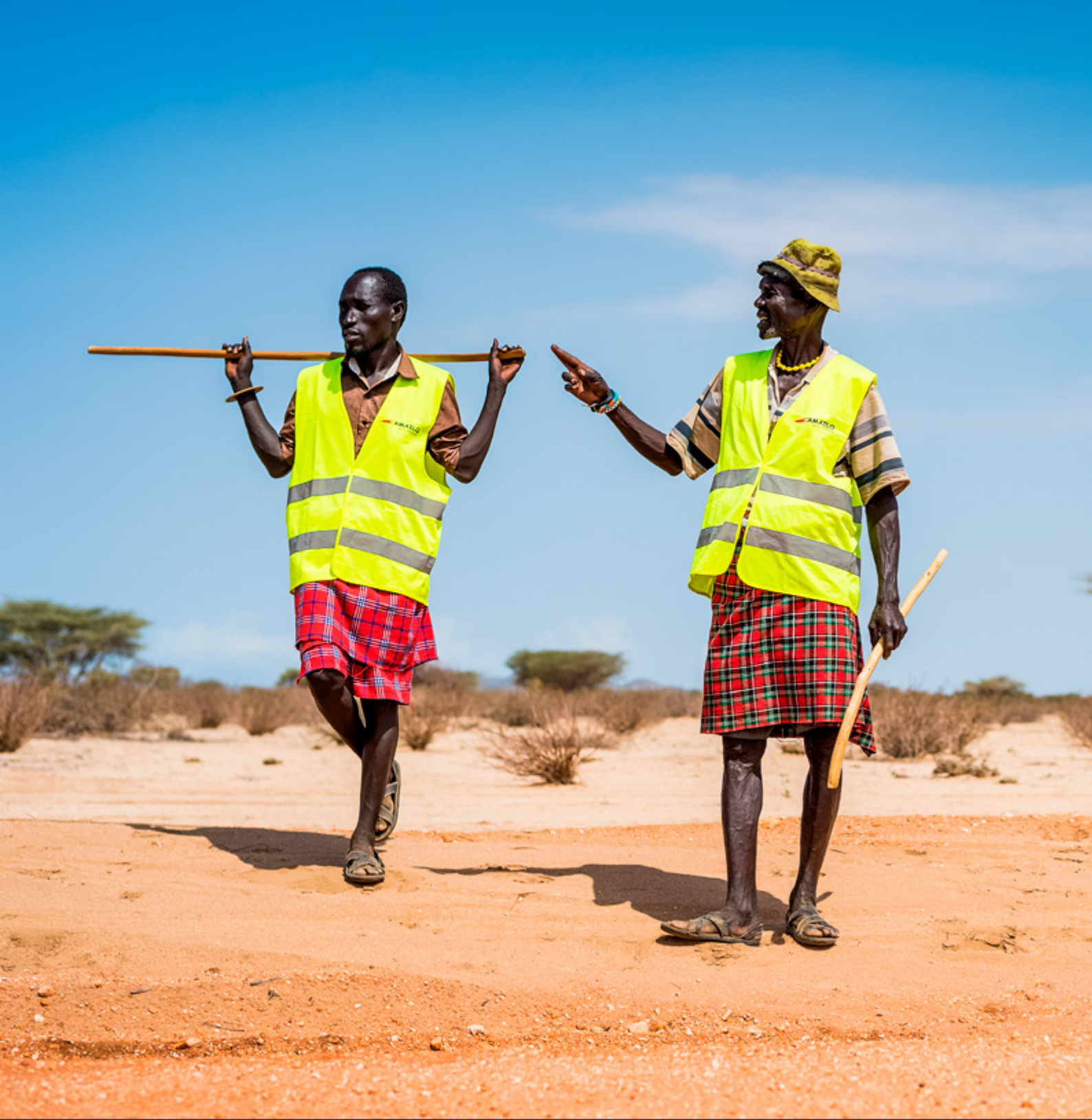
Photo: Turkana road marshals employed by the local company Amailo, subcontracted by Tullow. Work for local residents is thinly spread and precarious – road marshals, concrete mixers, and cleaners are the more common types of work available for Turkana. Few are employed in more specialist positions on oil rigs.

To find out more read 'Building Peace In the New Oil Frontiers of Northern Kenya' on page 6.