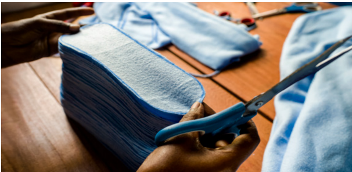
Photo: Uganda, Kitengeesa. A worker trims and stacks sanitary pads before they are lined and sewn at the AFRIpads factory. Started by volunteers in 2009, AFRIpads manufactures reusable fibre sanitary pads.

Catherine Dolan, SOAS, University of London