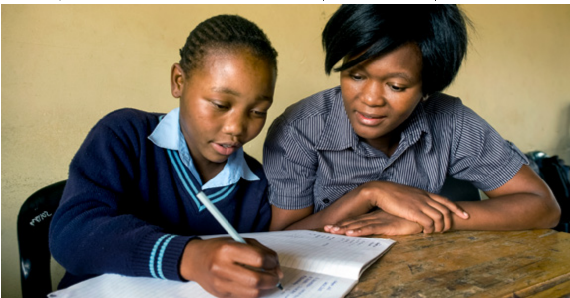
Photo: In a South African High School, a trainee teacher helps a pupil with her homework.

The research also highlighted how the two countries' national education policy directives took different approaches to guide how teachers might contribute to their respective policy visions of peace. In Rwanda, for example, the state has incorporated teachers into