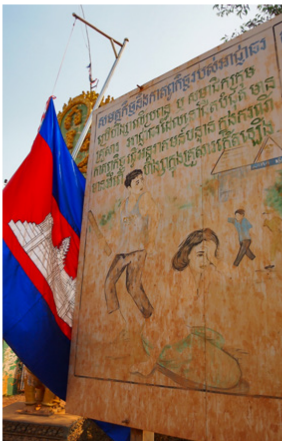
Cover photo: Commune poster building awareness about domestic violence in Cambodia.

The findings also highlighted the inadequacy of financial and human resources to support legal training on implementation and enforcement of DV law, together with confusion over women’s rights, as the environment is such that women are actively