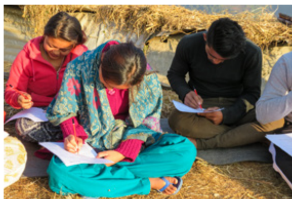
Cover photo: Youth analysing how they navigate uncertainty in the earthquake affected hills of Nepal.

The research aims to address youth understandings of uncertainty, violence, poverty, and rights in post-conflict and fragile environments, to provide insights into how to support and sustain pathways out of poverty for street-connected and marginalised youth. These young people have been left out or discriminated against because of gender, sexuality, caste, ethnicity, religion, poverty, abusive situations within families, negative school experiences, or due to fragile environments or conflicts amongst communities. They have not been heard in decision-making and policy formulation, and face limited employment opportunities. Many are working in the informal sector, their small businesses and hard labour at best not supported; at worst illegal. Some want to leave the country in search of new, more hopeful futures.