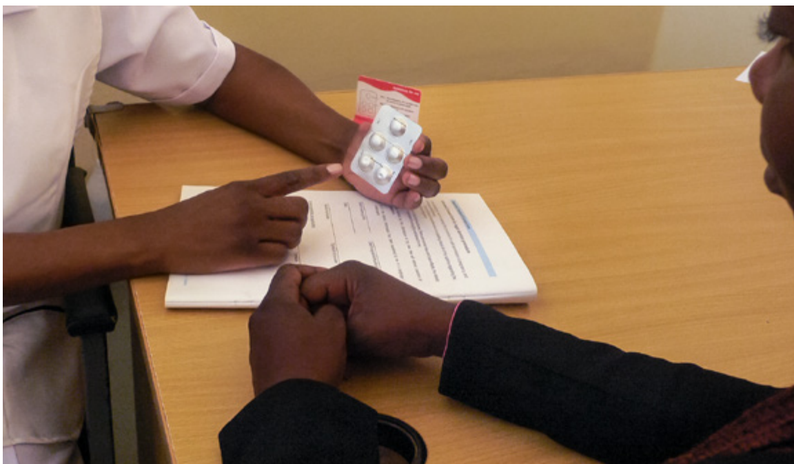
Photo: Medical abortion consultation in Zambia.

Based at a Zambian Government Health Facility in Lusaka, the researchers interviewed over 100 girls and women coming either for an abortion or for post-abortion care after an unsafe abortion. The research team worked closely with midwives to gain informed and considered consent from all the participants.