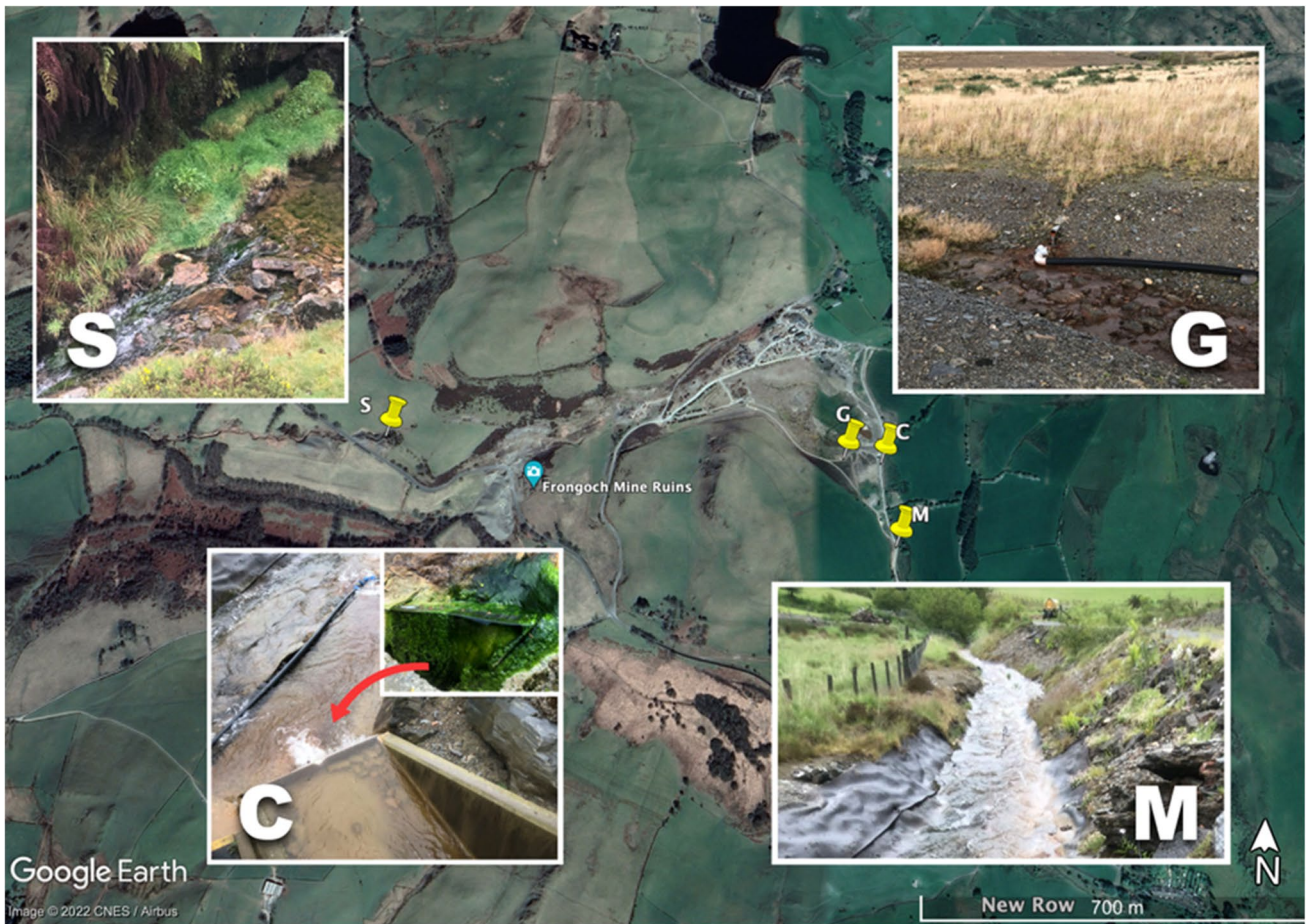
Fig. 2 The four sample collection sites in Frongoch Mine. Site C is the culvert water from Frongoch tailings; Site M is a mixed stream downstream of Site C; Site G

is the Frongoch groundwater discharged; Site S is a discharge stream from Frongoch Adit