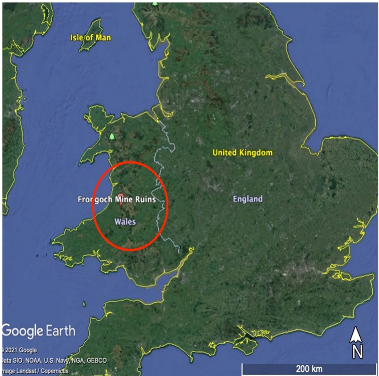
Fig. 1 The location of Frongoch Mine in the UK.

determined by inductively coupled plasma-optical emission spectrometry (ICP-OES) (Varian ICP-OES 720-ES, USA).