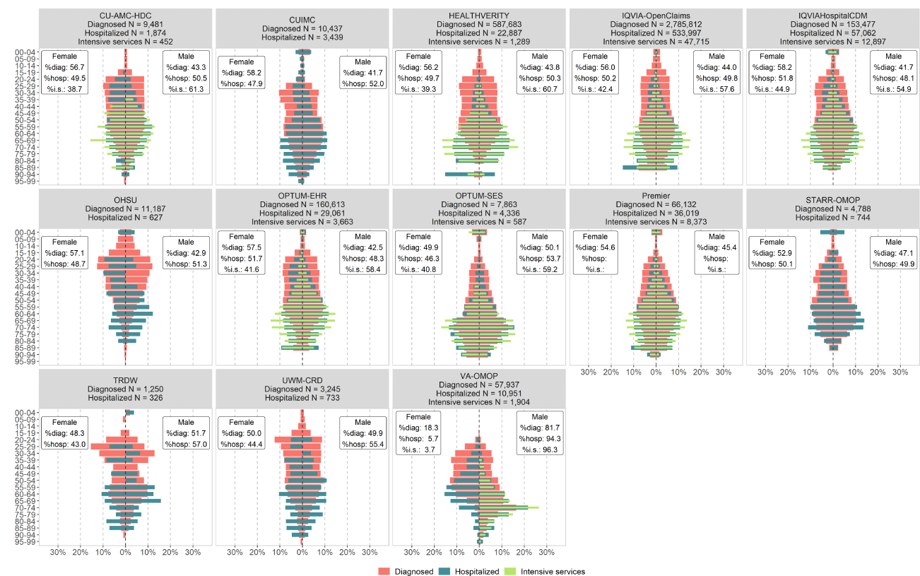
Figure 2 Distribution of diagnosed, hospitalized and requiring intensive services COVID-19 cases by age and sex across the OHDSI COVID-19 network in the United States.

In the USA, the proportion of diagnosed cases generally decreased with age, with most diagnosed cases being within the 25 to 60 age group. The proportion of cases hospitalized and intensive services increased with age, with the highest proportions of cases of hospitalized, or intensive cases in the 60 to 80 year age group (Figure 2). A slightly higher proportion of women were diagnosed than men but a greater proportion of men were hospitalized (and where available, required intensive services) than women in the USA databases. In Europe, databases captured diagnosed or hospitalized cohorts but had limited information on intensive services. In Europe, databases capturing hospitalized cases (HMAR, HM-Hospitales, SIDIAP, and SIDIAP-H) showed a similar trend to the USA databases in that there was a higher proportion of men were hospitalized than women (Supplementary Figure 1). Unlike the USA and European databases, there was also a higher proportion of women in hospitalized cases in the South Korean database (HIRA). Age-wise trends in the European and Asian databases were similar to those in the USA databases, in that the bulk of the diagnosed cases