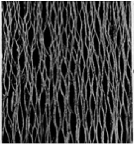
Fig. 1. Distribution and network of vascular tissue in a single stem layer of Papaya. According to the text in the script, there are 20 such layers of vascular tissue, one inside the other (like Russian dolls) and surrounding the whole trunk. The bundles are connected through enormous numbers of tangential connections and perhaps anastomoses to form a complex excitable structure. “The existence of a system of nerves enables the plant to act as a single organized whole” - a requirement perhaps for selection on fitness (From Calvo, Sahi and Trewavas 2017b - Figure and quote taken from Fig. 54, page 121.; Bose, 1926).

and father of the field of plant electrophysiology, J.C. Bose. From his (unfortunately) largely ignored The Nervous Mechanism of Plants , a book that dates back to 1926, we learn that the vascular system (Fig. 1) of the Papaya tree consists of vascular elements cross-linked by numerous, irregularly distributed, tangential connections. In mature stems and trunks, this vascular architecture becomes very complex, showing tangential connections and anastomoses (cross-links) between numerous bundles, forming a complex, reticulated system. This vascular system, originally thought to mediate exclusively the transport of water and nutrients, allows plants to coordinate their behavior, with electric signaling occurring over long distances through the vascular bundles (see Calvo et al., 2017).