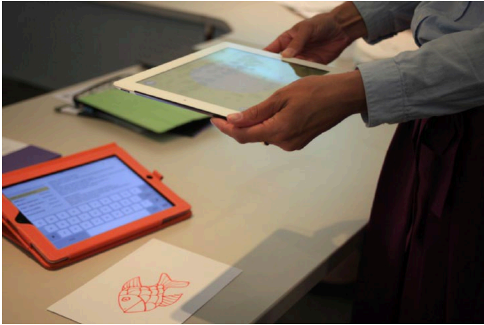
Figure 6. The Squiggle Fish app.

Playing the game was a good way of understanding how the narrative of a game changed across platforms. This was an area that the network explored further by playing digital and physical versions of the same game narrative, such as the Angry Birds app (Rovio Entertainment) and the physical game Angry Birds: Star Wars Death Star Jenga. Using these ideas, the network members were also asked to explore the use of the physical and digital domains in the board-game redesign session (outlined above). In relation to this, one group designed a game called Cancer Tower, based on the three-dimensional game Jenga. The idea of Jenga is for each player to remove one block from a stack of them and place it on the top without the stack falling over. The team redesigned Jenga so that the stack of blocks would represent the body, and some of the block ends were coloured red (Figure 7).