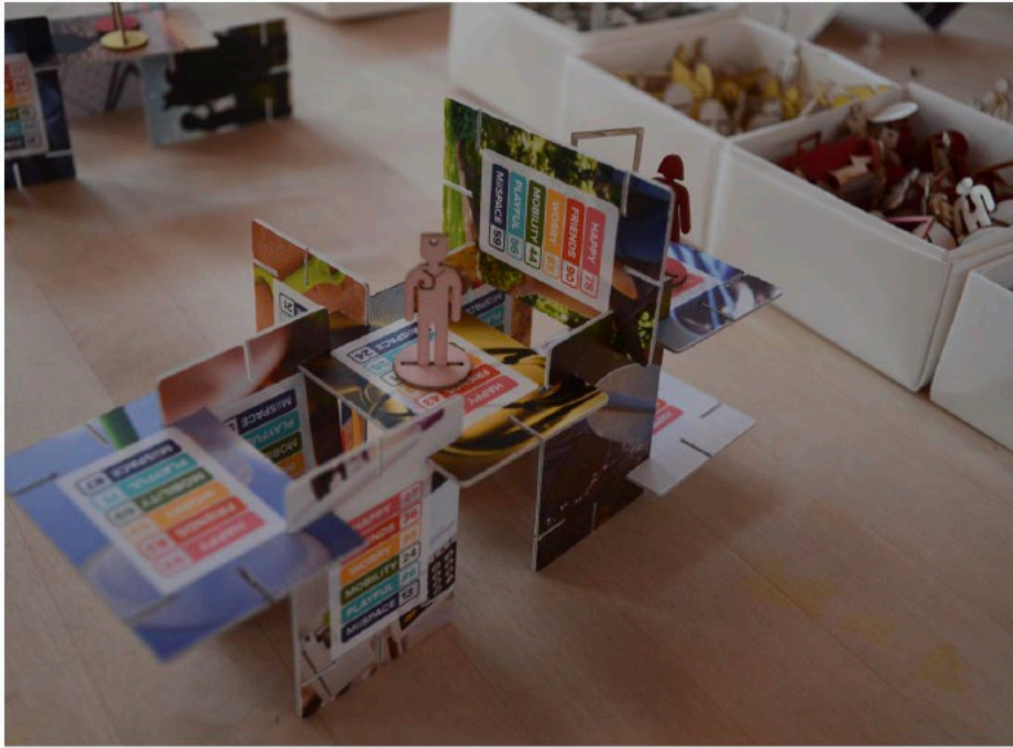
Figure 8. Hospital Heights.

Hospital Heights is a three-dimensional game based on a combination of ideas from traditional physical games such as Top Trumps and Eames' House of Cards. At the start, the game is played in a similar way to Top Trumps, where each player has a series of cards with categories and related scores. On their turn, a player calls out a category and everyone playing checks their score for it. The person with the highest score wins the cards of all the other players from that round. In the Hospital Heights version, the cards are toughened with photographic images on one side of play, medical equipment and spaces. On the other side, the categories relate to physical and emotional themes in connection with the image on the other side of the card, such as mobility, the opportunity to have your own space, playfulness and worry. The representation of these spaces and equipment in photographs is tied to the findings that high-modality images are best connected to conveying factual information.