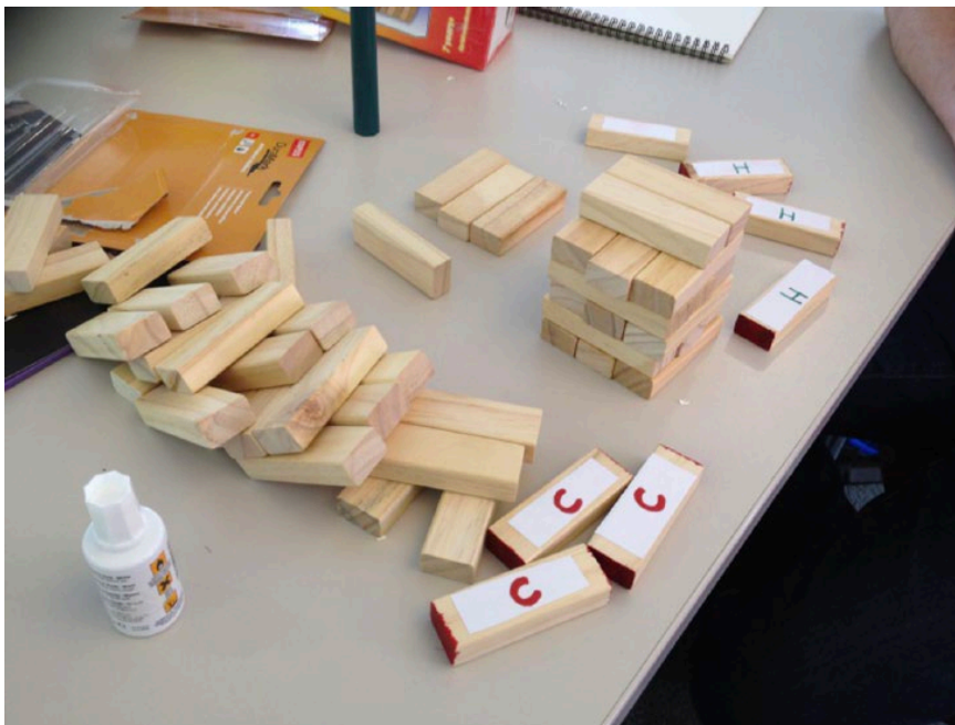
Figure 7. Cancer Tower.

Playing the game was a good way of understanding how the narrative of a game changed across platforms. This was an area that the network explored further by playing digital and physical versions of the same game narrative, such as the Angry Birds app (Rovio Entertainment) and the physical game Angry Birds: Star Wars Death Star Jenga. Using these ideas, the network members were also asked to explore the use of the physical and digital domains in the board-game redesign session (outlined above). In relation to this, one group designed a game called Cancer Tower, based on the three-dimensional game Jenga. The idea of Jenga is for each player to remove one block from a stack of them and place it on the top without the stack falling over. The team redesigned Jenga so that the stack of blocks would represent the body, and some of the block ends were coloured red (Figure 7).