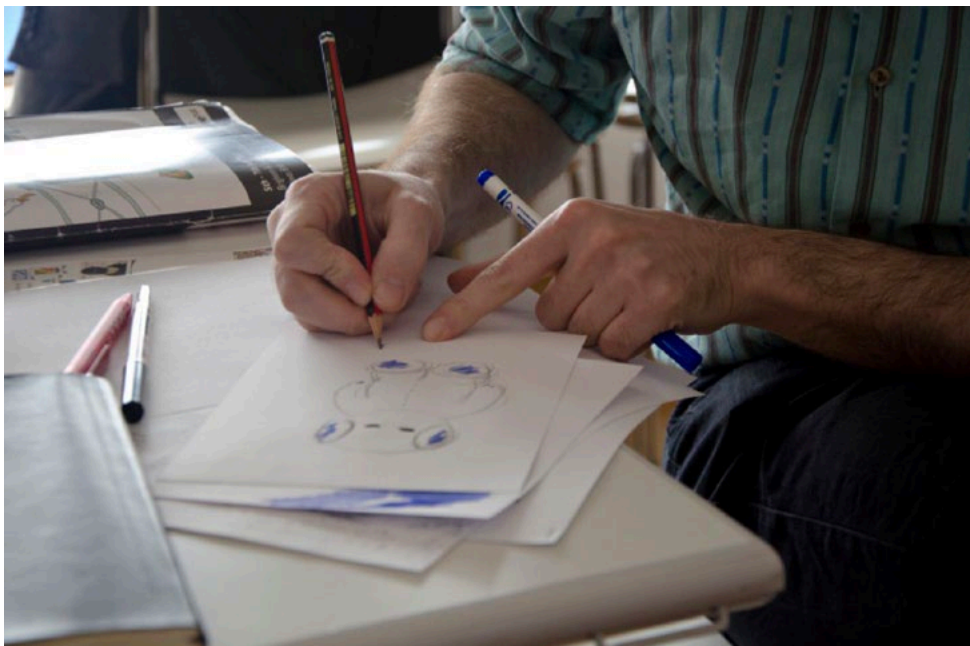
Figure 2. Drawing childhood comforters.

The ideas described above were not familiar to all the network members, and were indeed just emerging in the work of myself and two other academics in the project (Cheeseman and Finn). As a result, two drawing activities led by artists allowed the network members to explore how low modality graphics such as those used in graphic novels or comics can be used to convey emotions. The first drawing activity was led by the artist Isobel Williams, who started by showing examples of her work that have used drawing in situations where other mediums might have been considered invasive, such as allowing cancer patients to express very private emotions and experiences, and recording proceedings within legal courts. Following this, Williams encouraged the network members to draw items that we used as comforters in our childhood (Figure 2).