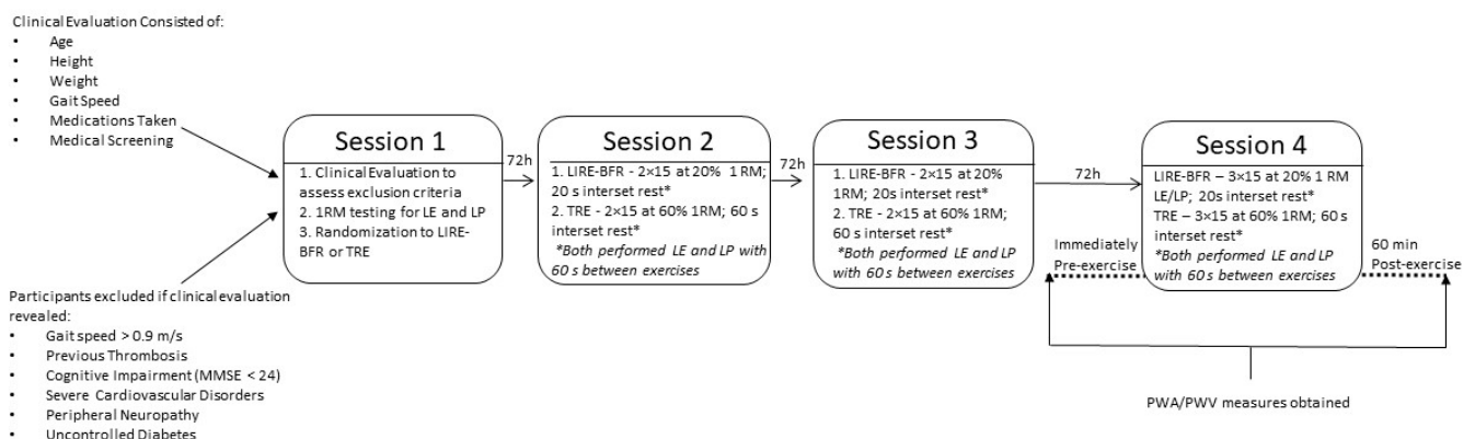
Figure 2. This diagram shows the sequence of events during the pilot study.

Following the initial clinical screening and one-repetition maximum assessment, each participant was randomized into a low intensity blood flow restriction exercise group, performing leg press and leg extensions at 20% 1RM (LIRE-BFR) or traditional strength training (TRE) at 60% 1RM. All participants participated in two familiarization sessions prior to pilot data collection, with each session separated by 72 h. Before and one hour following completion of the selected exercises during the pilot data collection, measures of arterial stiffness were obtained, and the data were used to compare changes between groups. An overview of the study protocol is shown in Figure 2.