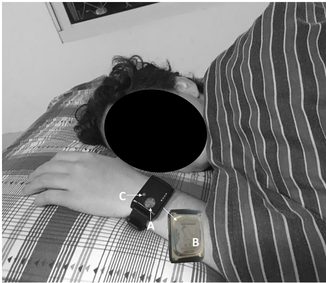
Figure 1. The circadian monitoring device, composed of an accelerometer (internal, not shown in the figure), luxometer (A), a temperature sensor (B) and event-marker button (C).

Standardized procedures were performed on the device configuration (ActStudio 1.013®, Condor Instruments, Brazil) before handing it over to the participant, as follows: