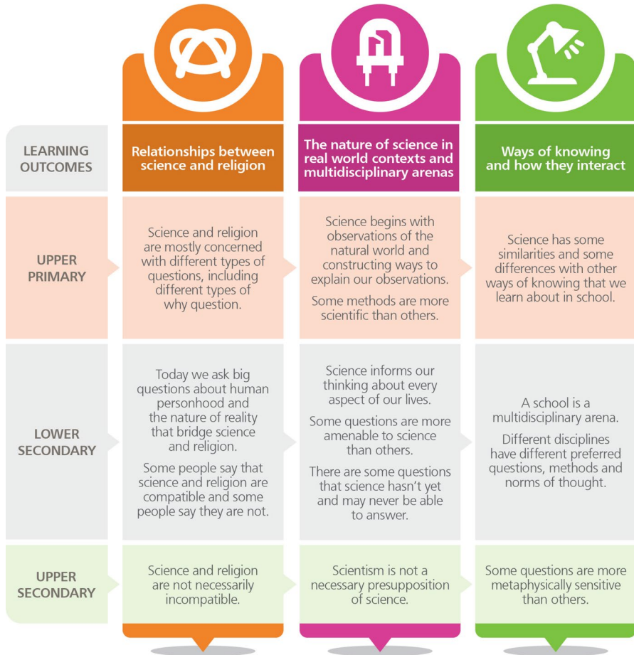
Fig. 1 Epistemic insight curriculum framework (Billingsley et al. 2018)

was based on convenience, suitable for a small-scale, exploratory study (Maxwell 2012).