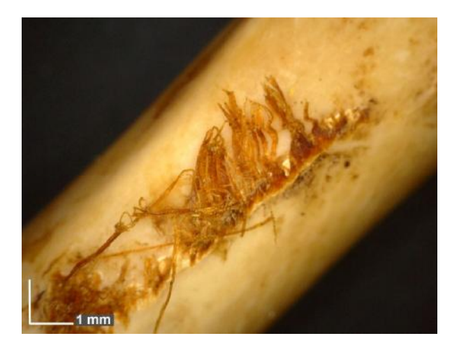
Fig. 2. Detail view of soft tissue remains on great auk ( Pinguinus impennis ) femur recovered at the Covesea Caves, north-east Scotland (unstratified context, Covesea Cave 2).