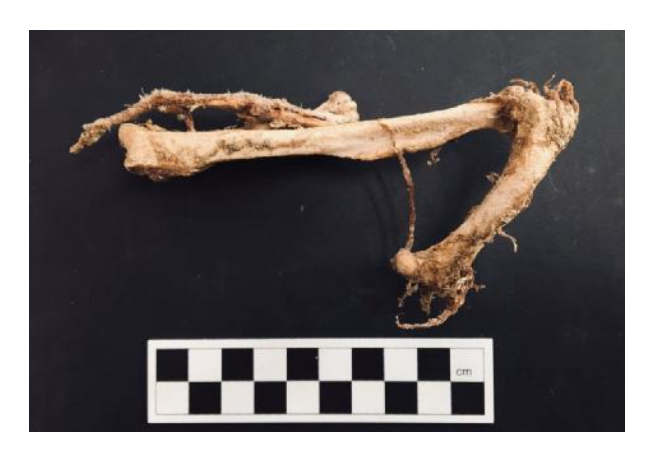
Fig. 1. An articulated great auk ( Pinguinus impennis ) leg fragment recovered at the Covesea Caves, north-east Scotland. Left to right: tarsometatarsus, fibula, tibiotarsus, and femur (Trench 4, Context 406, Covesea Cave 2).

Remains of the great auk have been identified in three of the four caves investigated. However, only one individual specimen was found at both Covesea Cave 1 and the Sculptor's Cave, with the overwhelming majority deriving from Covesea Cave 2. Preservation of the remains overall was consistently excellent, with little to no weathering or fragmentation. One recovered specimen represented the remains of an articulated "leg", including tibiotarsus, femur, fibula, and tarsometatarsus (Fig. 1). In addition, some bones still had the remains of soft tissue adhering to them (Fig. 2). Unfortunately, most of the great auk fragments derived from unstratified or mixed deposits (Table 1) but in Covesea Cave 2 five fragments were attributed to stratified contexts of Neolithic/Bronze Age (N = 2) or Medieval/Post-Medieval date (N = 3).