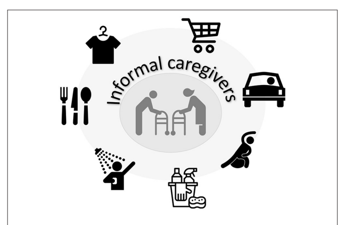
FIGURE 1 | Informal caregivers' roles. Some of roles undertaken by informal caregivers are depicted here, including help with feeding, dressing, traveling, shopping, cleaning, maintaining personal hygiene, and exercising. The breadth of functions many of them fill in the lives of the patients suggest that any improvement in patient independence has the potential to help alleviate some of the burden undertaken by the informal caregiver.

The most common needs of a stroke patient relate to daily activities such as bathing, dressing, and transportation, and less common needs relate to toileting and feeding (19) (see Figure 1 ). One of the main roles of family caregivers is providing transportation, with nearly 40% of informal caregivers reporting that they accompany patients to routine medical visits (20). The support that informal caregivers provide to patients allows individuals post-stroke to remain in their homes and communities for longer, thus postponing or even preventing