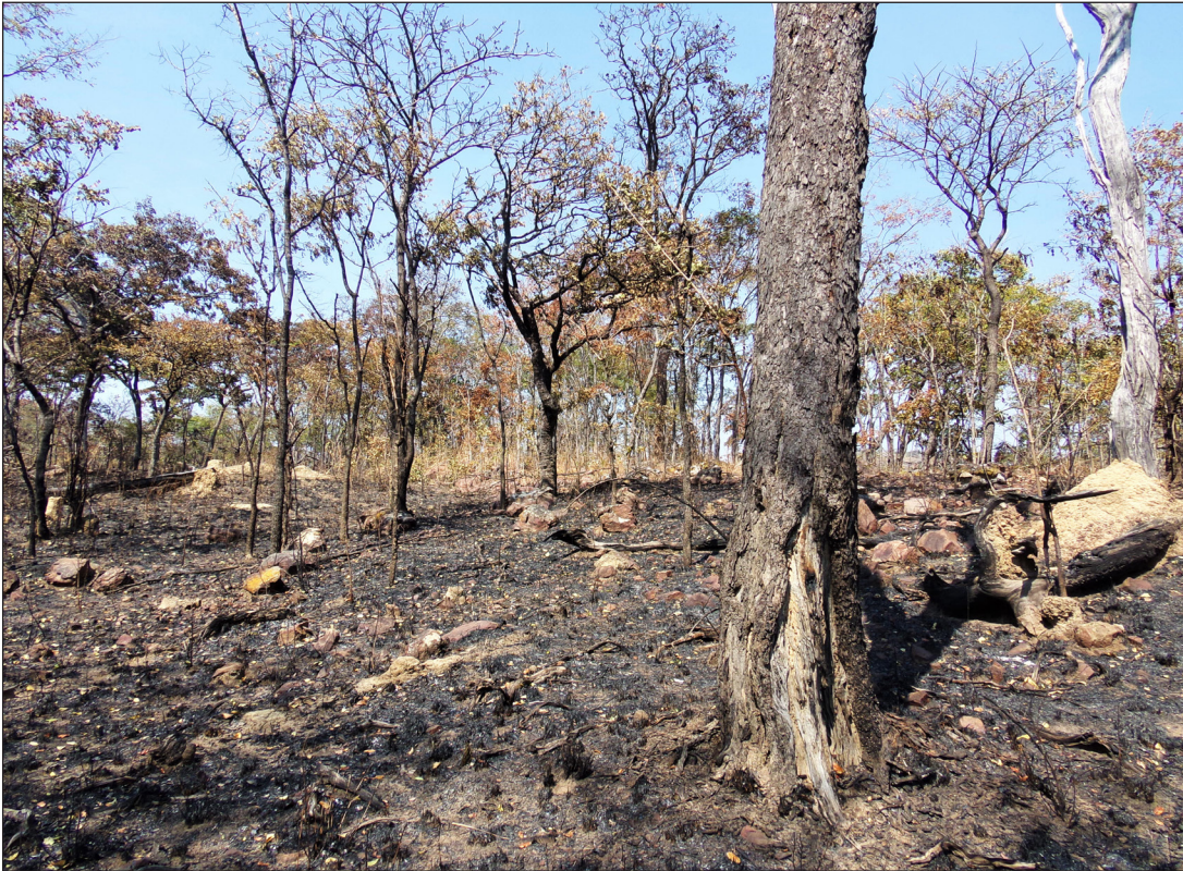
Figure 1. Charred landscape after the annual fires.