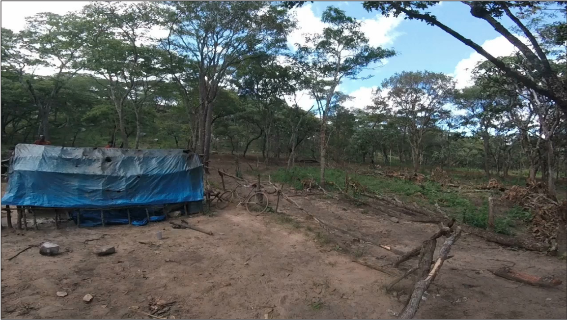
Figure 4. Abandoned corral by Tanzanian herders.

also increase their perceived risk (Hoare 2019). Charred landscapes increase exposure of animals to predation (Figure 1) and so chimpanzees may perceive greater risk given the lack of vegetation to conceal their presence, especially since the cattle are frequently accompanied by people and domestic dogs (see above).