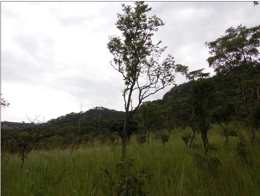
Figure 2. Wet season landscape with tall grass.