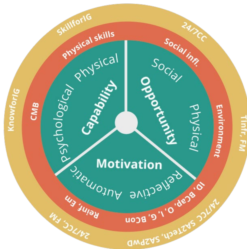
Figure 2: Our inductive findings mapped onto the combined and TDF model