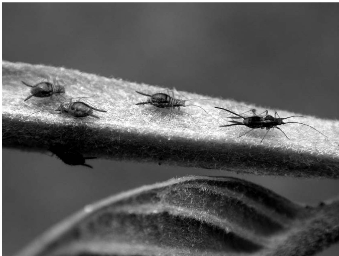
Fig. 1. Viviparous apterae and alatae of Greenidea psidii on Psidium guajava .

The apterae of Greenidea (Trichosiphum) psidii van der Goot 1916 (Fig. 1) are dark brown with long yellowish-brown siphunculi, apically curved outwards. There is a complete description, under the name Greenidea formosana (Maki), in Sugimoto (2008). They live on young shoots and undersides of leaves of species of Myrtaceae (mainly Psidium guajava L., but also on species of Callistemon , Eucalyptus , Eugenia , Malaleuca , Metrosideros , Rhodomyrtus , Syzygium and Tristania ); also, samples identified as this species have been recorded on other plants such as Ficus (Moraceae), Glycosmis (Rutaceae), Scurrula (Loranthaceae), Lagerstroemia (Lythraceae), Nesua (Clusiaceae), Rhamnus (Rhamnaceae) and Engelhardtia (Juglandaceae) (Halbert 2004; Blackman