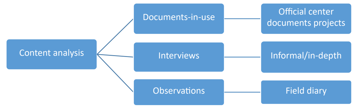
Figure 1. Sources and analysis process.

To analyse the case study in its natural context, we chose the following data collection techniques: school documents, field diary, classroom observations, and interviews. Content analysis is the research technique that has allowed us to analyze the reality of the educational context (Bardin, 2001). Figure 1 details the sources and the analysis process.