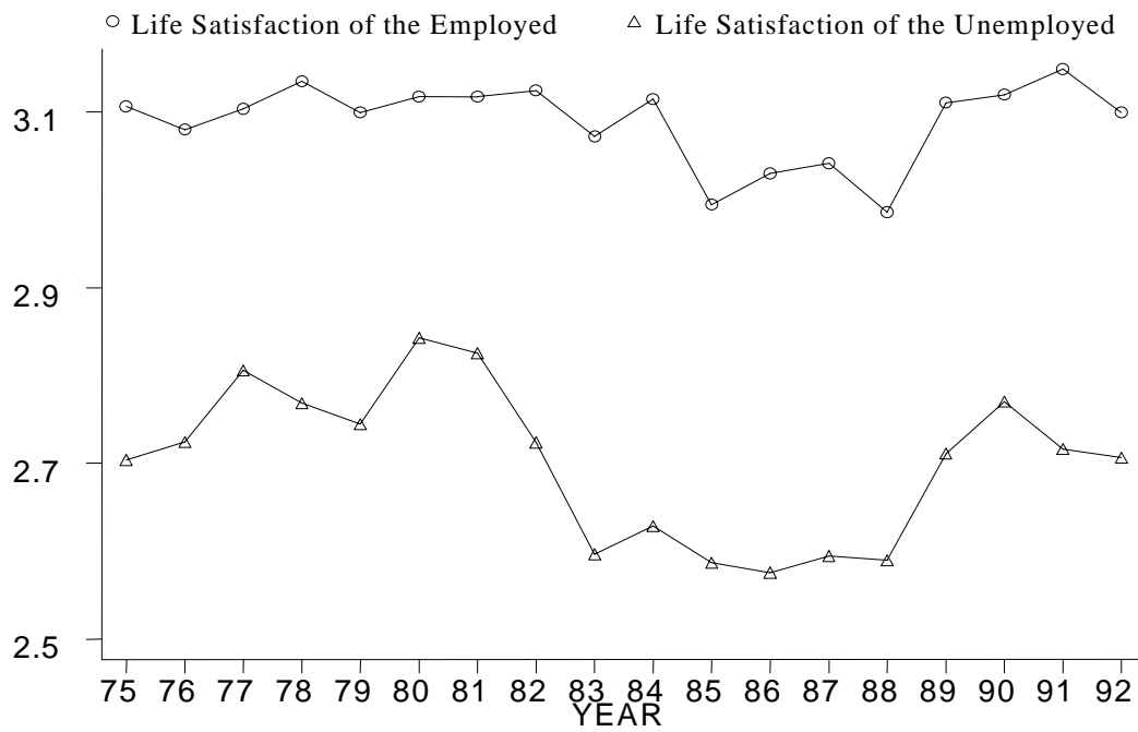
Figure 1: Average Life Satisfaction of Employed and Unemployed Europeans* (based on a random sample of 271,224 individuals).