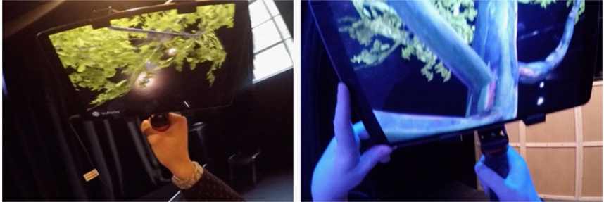
Figure 3. Ernest Remains augmented reality installation at Banham Theatre, University of Leeds (2019) by author. Virtual trees appearing on-screen

device, a forward motion produced by the need to follow the screen and keep focus directed towards it: