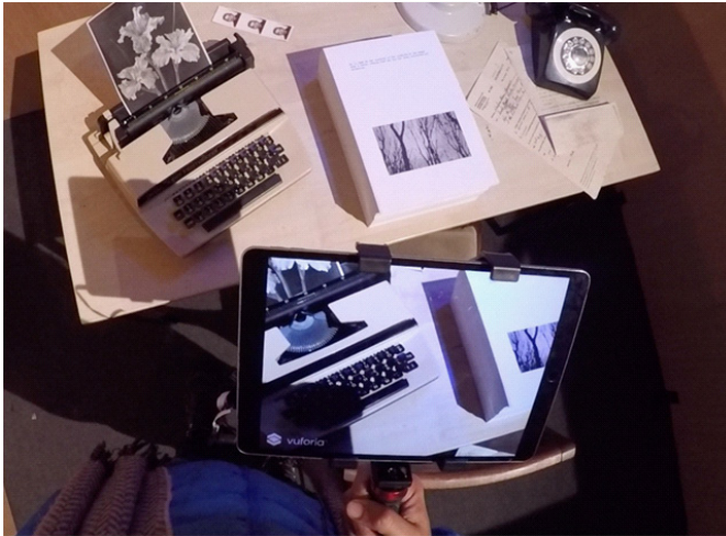
Figure 1. Ernest Remains augmented reality installation at Banham Theatre, University of Leeds (2019) by author. An audience member viewing the installation through the screen

emerged where the AR produced a scenographic spatiality, and I will focus on these moments in my discussion here.