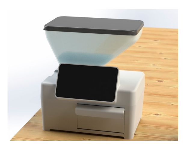
Figure 2. Salt Control-C equipment.

For soup, it dispenses salt according to the liters to be produced, and for main dishes it dispenses salt according to the number of servings to be cooked (Figure 2).