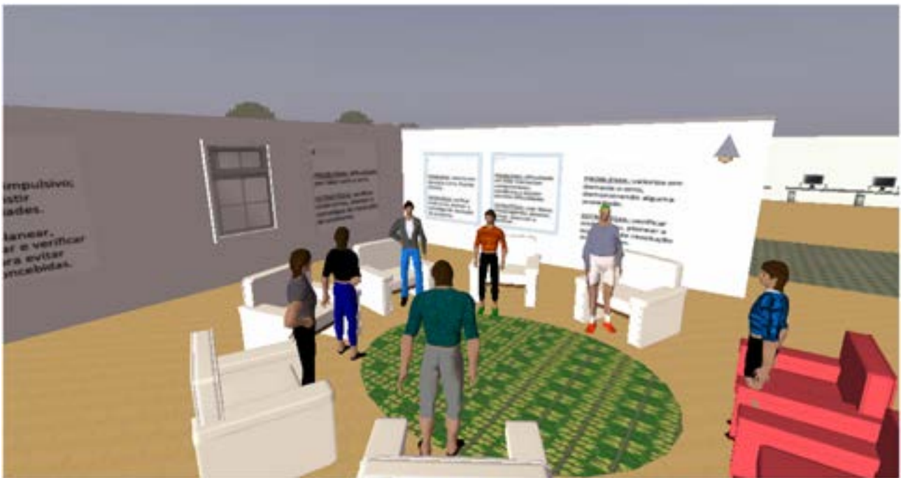
Figure 2. Example of a “hot seat” psychosocial rehabilitation session, in which participants and therapist are represented by an avatar.

Besides an initial face-to-face session and another at the end of the program, involving all the participants and the researcher in charge, the whole training, including cognitive, affective, and psychosocial components (see Figure 2), was administered via the VR platform VICERAVI. For the technical and logistical conditions to be equivalent for all participants, the sessions took place in the computers of the rehabilitation center where the samples were recruited.