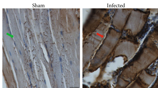
FIGURE 3: Immunohistochemistry analysis of S1PR1 in hind limb muscle of sham and S aureus -infected mice. S1PR1 was significantly upregulated in the muscle of infected mice (red arrow) comparing with sham mice (green arrow), scale bar = 100 \mu\text{m} .

*N = 3 per group, mean ± SEM of average SUV from 30 to 50 min. # Two-tailed paired t -test.