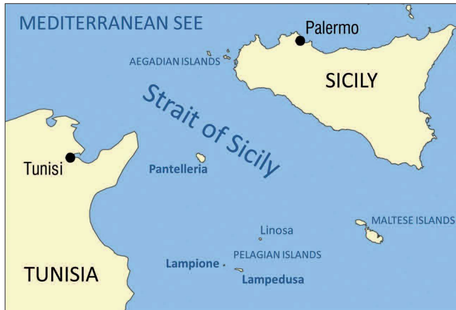
Fig. 1 — The Strait of Sicily islands.

whereas, the only examined specimen from the island of Lampedusa was a male preserved in alcohol in the Fontana collection at the Rovereto Civic Museum Foundation. All material was processed through fixation in alcohol 70° (for at least 1 hour) then clarified in KOH 10% water solution for 24 hours. From the potash, the specimens were transferred in distilled water in alcohol 70°, in alcohol 85° and in alcohol 95°. Each step lasted 10 minutes. Finally, specimens were put in a xylene bath lasting 20 minutes and later mounted on slide by inclusion in Canadian Balm (FONTANA et al. , 2002).