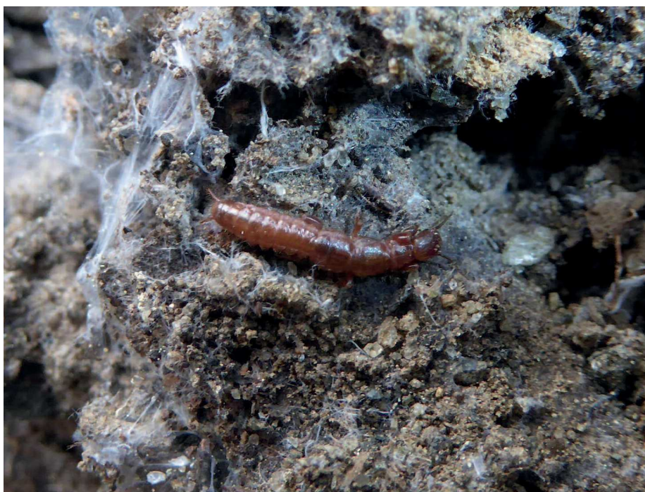
Fig. 3 — Adult or subadult webspinner female inside the silk tubes. Pantelleria Island, Montagna Grande, 525 m (Photo P. Fontana, 8. IV.2021).

almost sea level, in a green area located in front of the main church of the town of Pantelleria. All the specimens were collected alive and immediately placed in breeding conditions. At the end of May, a single individual, probably subadult, was found on the top of Montagna Grande, at 836 m. This individual has also been reared but unsuccessfully. The other individuals, probably adult females, were left in the rearing container to obtain a new and more abundant generation. From specimens collected at the beginning of April, an adult male was obtained at the beginning of June (Fig. 4). It was preserved in alcohol and processed for its slide mount in Canadian balm. The adult male has been identified, both on the basis of the original description (STEFANI, 1953) and on the redescription by ROSS (1966), as belonging to Cleomia guareschii Stefani, 1953.