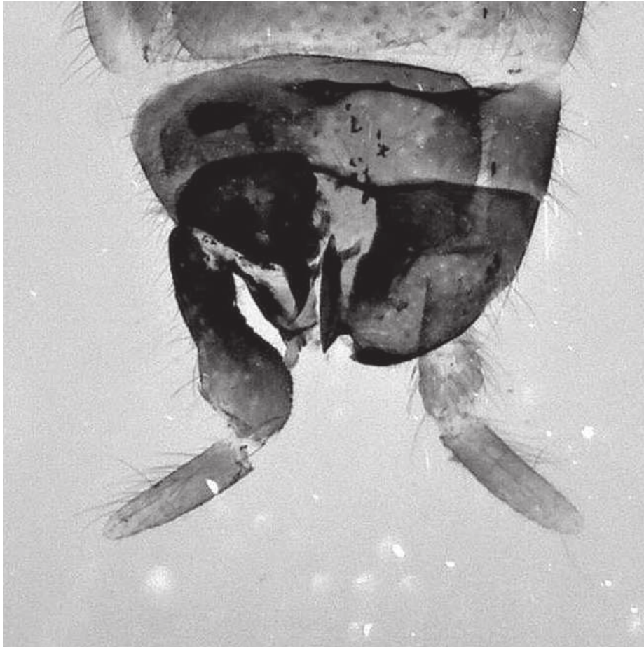
Fig. 7 — Terminalia of an adult male (mounted on slide) of Embia ramburi Rimski-Korsakow, 1905 from Italy, Marche, Marotta (PU) 26.III.2021.