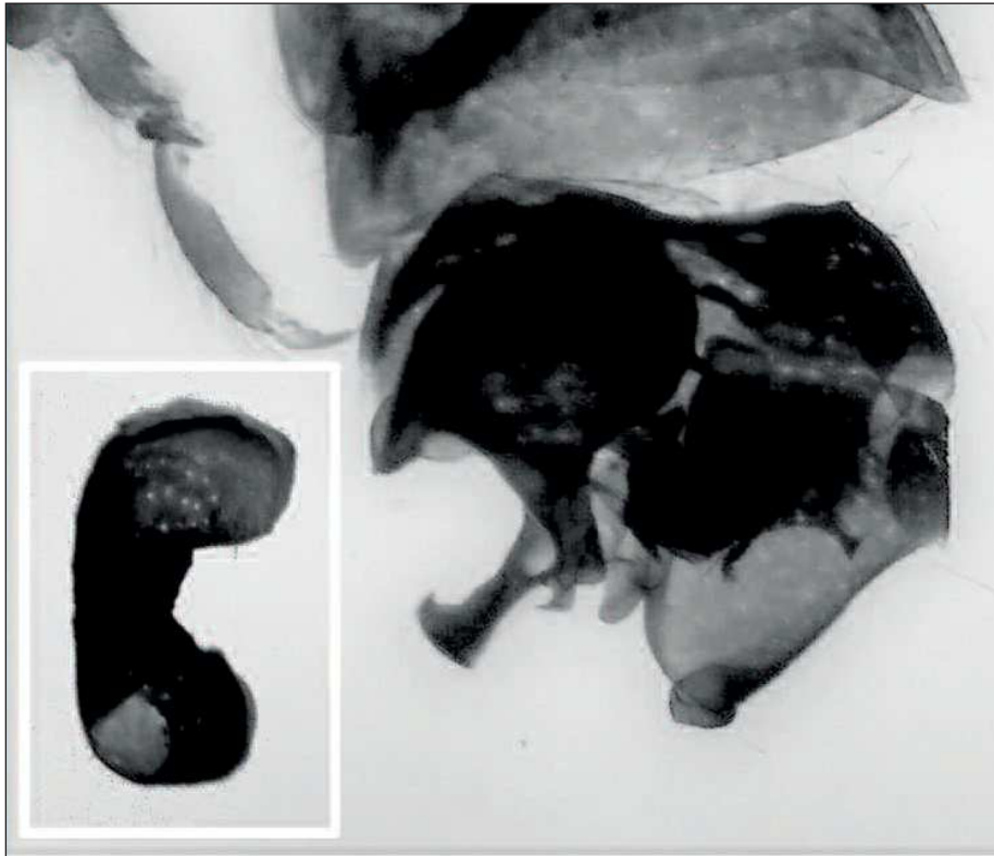
Fig. 4 — Terminalia of the single adult male (mounted on slide) obtained from the living specimens collected in Pantelleria (Montagna Grande, 525 m) and identified as Cleomia guareschii Stefani, 1953. Bottom left the cercus (Photo P. Fontana, 8. IV.2021).

structure in the text but he presents a clear drawing of the whole terminalia showing such apex as a round ending protuberance more or less membranous. On the other hand, ROSS (1966) describes this anatomical structure as a “median flap (MF) sclerotic with apex narrowly-acute and curved mesad” and provides the corresponding illustration. The male terminalia of the specimen from Pantelleria, have the median flap exactly corresponding in shape and consistence to the description and the drawing presented by STEFANI (1953). The left cercus has been examined before inclusion in Canadian balm, and corresponds to that of C. guareschii .