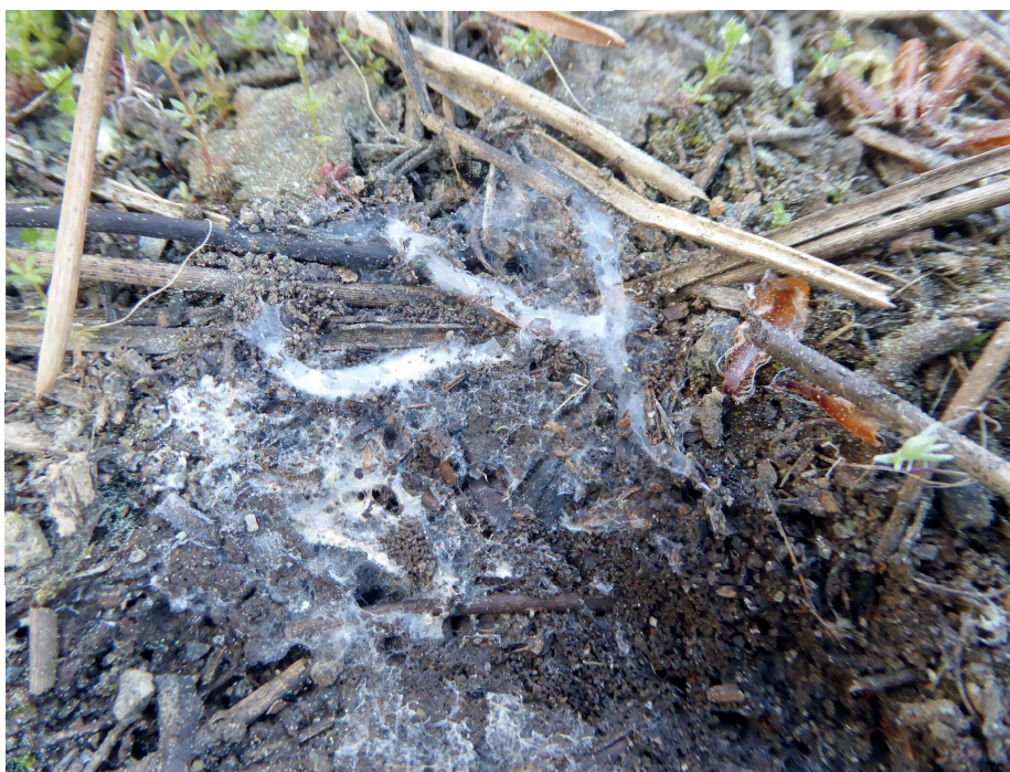
Fig. 2 — The silk tubes that testify to the presence (present or past) of webspinners. Pantelleria Island, Montagna Grande, 525 m (Photo P. Fontana, 8. IV.2021).

During a visit to Pantelleria in April 2021, as part of a research on pollinators entrusted by the Pantelleria Island National Park to the Edmund Mach Foundation of San Michele all'Adige (Technology Transfer Center) and to the University of Palermo (Department of Agricultural, Food and Forestry Sciences), attention was also paid to the presence of Embioptera, being this order not yet known from the island. Traces of the presence of these insects, namely the silky tubes in which they live (Fig. 2), were found in all the visited places. In several cases some individuals were also found inside the silky tubes, mostly juveniles but also some adult or sub-adult instars (Fig. 3). Among the various sites visited at the beginning of April, the one that provided the greatest number of individuals was located in the center of the island, in a clearing of an holm oak forest at about 525 m above sea level, on the southern slope of Montagna Grande. Embioptera were also found at