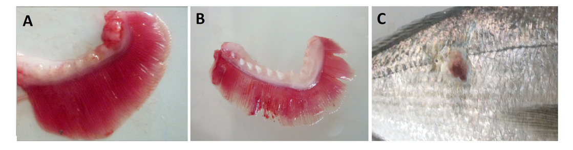
Fig 1. External lesions on Sparus aurata due to Pelagia noctiluca jellyfish exposure. A. Fish gill from control group; B. abrasion, haemorrhage, depigmentation and increased thickness of lamellar filaments of a fish from the high jellyfish density group 24 h after exposure to jellyfish; C. wound with necrotic tissue on the flank of Sparus aurata fish from the medium density group 2 weeks after exposure to jellyfish.