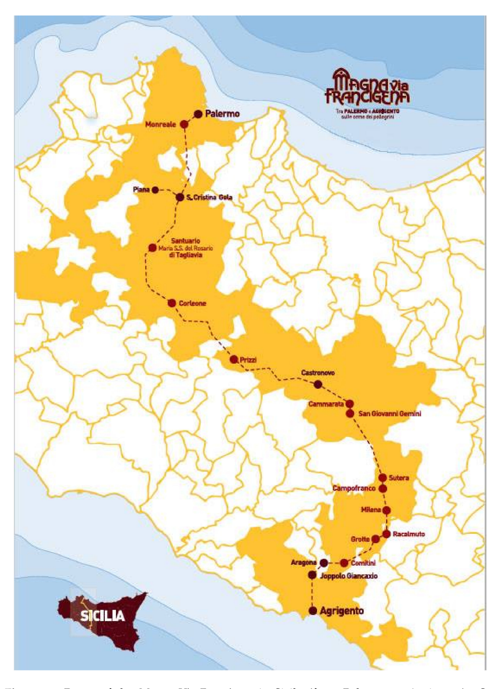
Figure 2. Route of the Magna Via Francigena in Sicily (from Palermo to Agrigento). Source: www.viefrancigenedisicilia.it/.