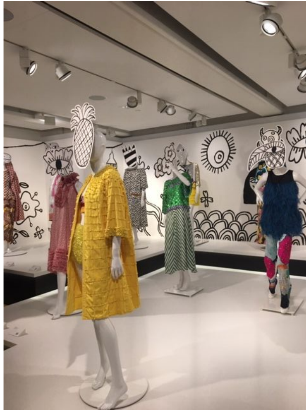
Figure 1 - Easton Pearson's exhibition EP held at the Museum of Brisbane, 2018-19, Author 2

1 2 3 4 5 6 7 8 9 10 11 12 13 14 15 16 17 18 19 20 21 22 23 24 25 26 27 28 29 30 31 32 33 34 35 36 37 38 39 40 41 42 43 44 45 46 47 48 49 50 51 52 53 54 55 56 57 58 59 60