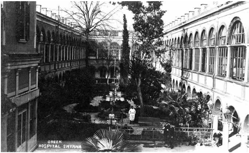
Figure 2. The Greek Saint Charalampos Hospital.

to the literature, a separate building for the care of the mentally ill was established in 1882 (Vladimiros, 2008). In 1833, the church of Saint Charalampos was erected in the Greek Hospital's courtyard. Charalampos was an early Christian priest who was martyred in 202. He was condemned to death, at which time he prayed to God that the people living near his relics would never suffer famine or disease. His relics can be found throughout Greece, including Smyrna. Saint Charalampos protected the people of Smyrna from the plague (Argiropoulos, 1995; Clogg, 1982; Karadimou-Gerolymou, 2000; Simopoulos, 1975).