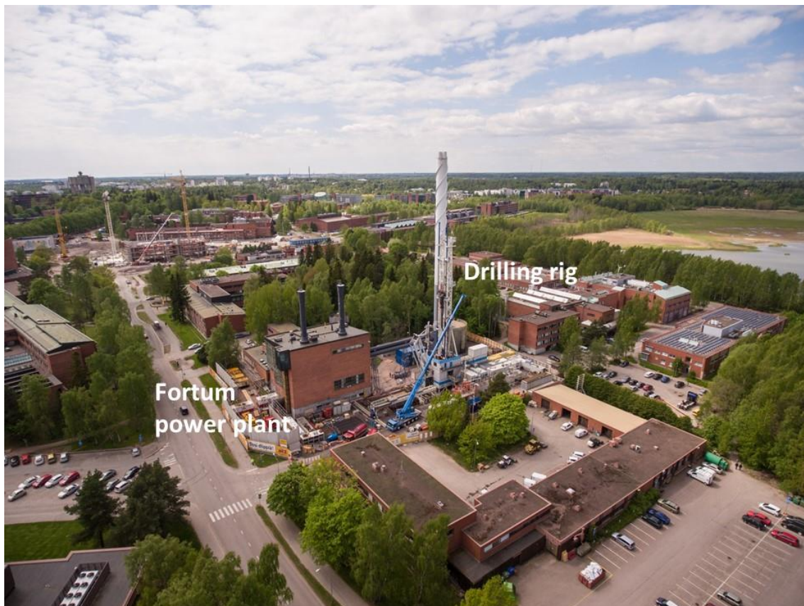
Figure 1. The St1 Deep Heat drill site in Espoo in 2019.

The theoretical energy resource of bedrock is huge. For instance, assuming the temperature decrease in an EGS reservoir during production is 50°C, and the volume of the reservoir is one km 3 and the specific heat capacity of rock is 800 J/kg/K, the total theoretical energy content is 30·10 6 MWh. The most important challenge related to exploiting such an energy resource is how the heat can be extracted from the rock. In EGS it is done by circulating water as a heat transfer fluid in the formation between two deep boreholes. Natural level of hydraulic conductivity is very low at depths of several km, and provided by natural fractures of the rock. In most cases, the natural hydraulic conductivity is too low for EGS production, and must be improved. It is done by hydraulic stimulation. In stimulation, large amounts of fluid are injected into rock which widens the natural fractures and enhances the conductivity. Under the high tectonic stress of bedrock, stimulation generates slipping of fracture surfaces, meaning micro-earthquakes. In an EGS project, stimulation must be carried out sustainably without generating hazardous seismicity to the surrounding society. In the present paper, we provide an insight to the project and its major achievements and challenges.