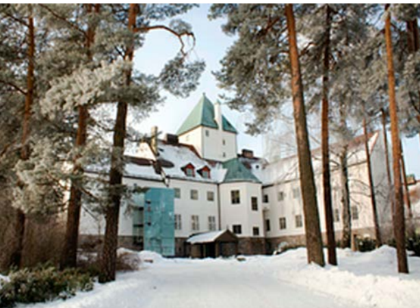
Fig. 3. The Norwegian Center for Holocaust and Minority Studies and its archives are located in a house called 'Villa Grande'. During the Second World War the villa became the residence of Vidkun Quisling, head of the Norwegian National Socialist party (Nasjonal Samling) in Norway and Hitler's Norwegian puppet government from 1942 to 1945.

While the study of antisemitism is a field of its own, and its relevance to archives dealing with the history of the Jews can be debated, there is no doubt that hatred of Jews had consequences for the Jews of Norway. Also, the presence and the level of antisemitism among those that were to constitute the Norwegian resistance movement during the Second World War are at present the object of a heated debate in Norway and have been for the past two years (Michelet 2018, 2021; Sørensen and Simonsen 2020; Berggren et