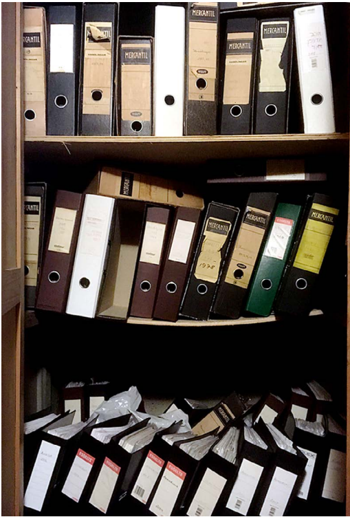
Fig. 2. The onsite archives of the Jewish Community of Helsinki before the cataloguing (September 2017).

granted access by special permission, owing to its strictly personal nature.