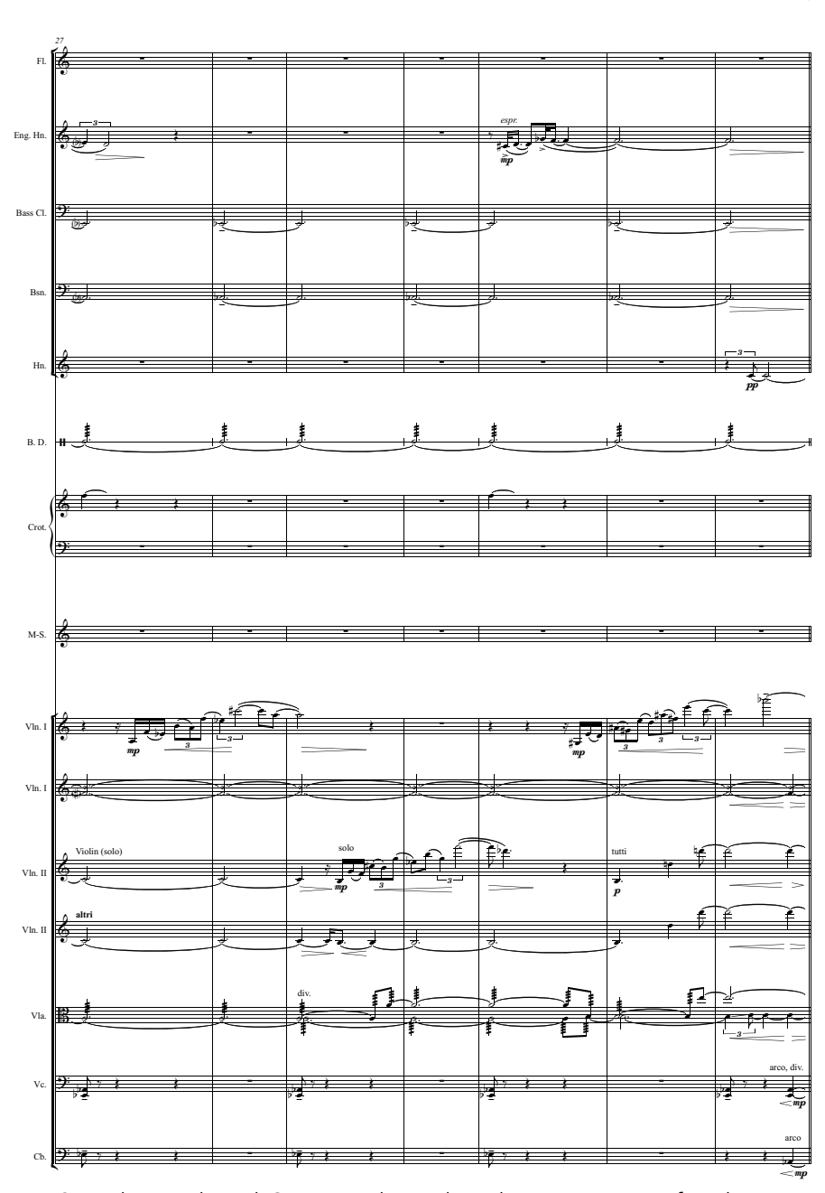
Fig 2. Outi Tarkiainen, The Earth, Spring's Daughter , Prologue, bars 27-33. An excerpt from the score. The Longing motif in the first violins (bars 27-29 and 31-33) and a phrase from the Earth motif (bars 31-32). Copyright: Edition Wilhelm Hansen. Used with kind permission.