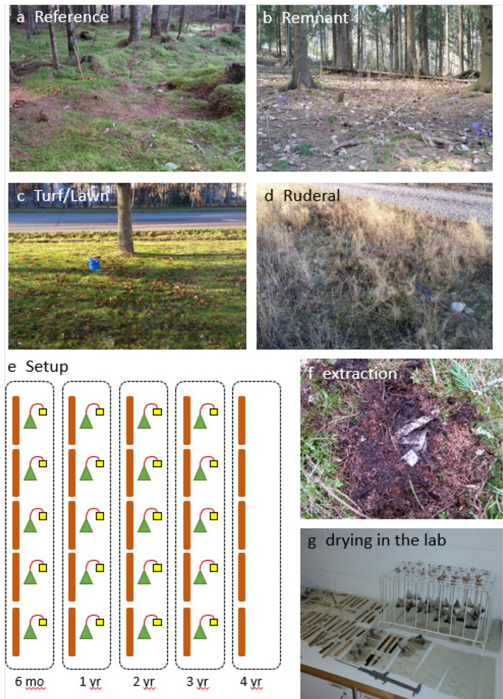
Fig. 1 Field sites and study design. a–d: examples of the four land-use categories investigated, e: field setup showing the five birch wood lolly stick and pyramid shaped green teabag pairs per visit (6 mo = six months after burial, 1 yr, 2 yr, 3 yr, 4 yr = one to four years after burial). Pairs were buried 25 cm apart, f: a lolly stick and teabag being extracted, g: stick and teabag drying in the laboratory. Note that the extraction sequence within a plot raises the potential for bias (e: Setup). For instance, an unknown underlying environmental gradient could have been present along one of the extraction periods (say, visit ‘1 yr’). However, the chance of this being the case across all five replicate plots, and for the same extraction is low

one year (28–29 April 2016), two years (5–10 May 2017), three years (5–7 May 2018), and four years (25–30 April 2019). During each sampling, we removed five wood stick and teabag pairs, except during the last visit when we only removed the remaining five wood sticks per plot.