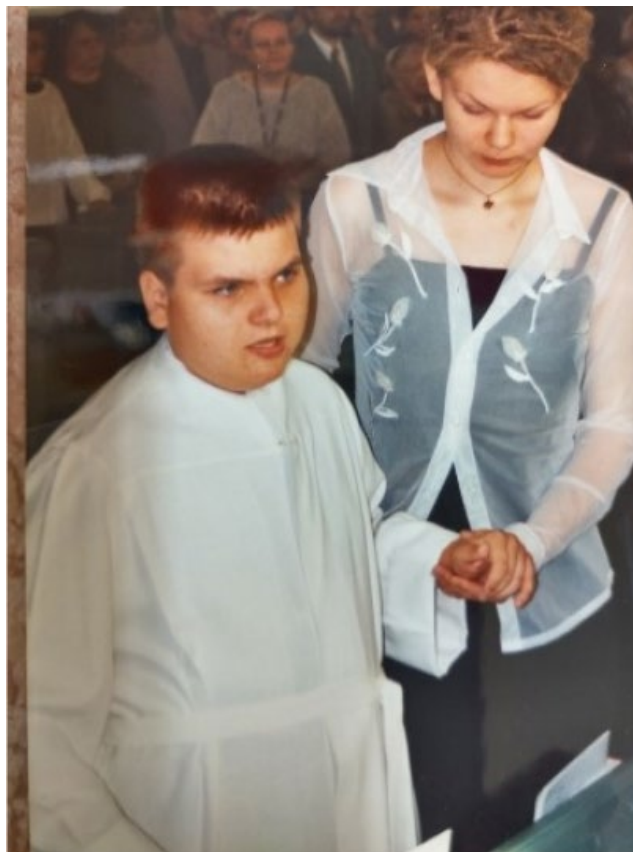
FIGURE 2 Patients at the age of 15 years

Etiological studies were updated. Brain MRI finding, repeated for the fourth time, was normal, as earlier. For genetic analyses, DNA was extracted from peripheral blood. Microarray did not show any clinically relevant copy number variants. A NGS-based analysis was performed with Sophia Genetics custom clinical exome solution including 4430 disease-related genes and Illumina sequencing. Over 98% of target regions was covered with 50x. Variant annotation and filtering were performed with Sophia DDM and visualized with IGV (Broad Institute). The analysis revealed a novel hemizygous likely pathogenic missense variant in the MECP2 gene, c.500G>C, p.(Arg167Pro) which has not been described in databases (gnomAD, ClinVar, LOVD, HGMD Professional) or in the literature. The variant localizes in exon four, changes an evolutionally conserved amino acid from arginine to proline, and affects the important