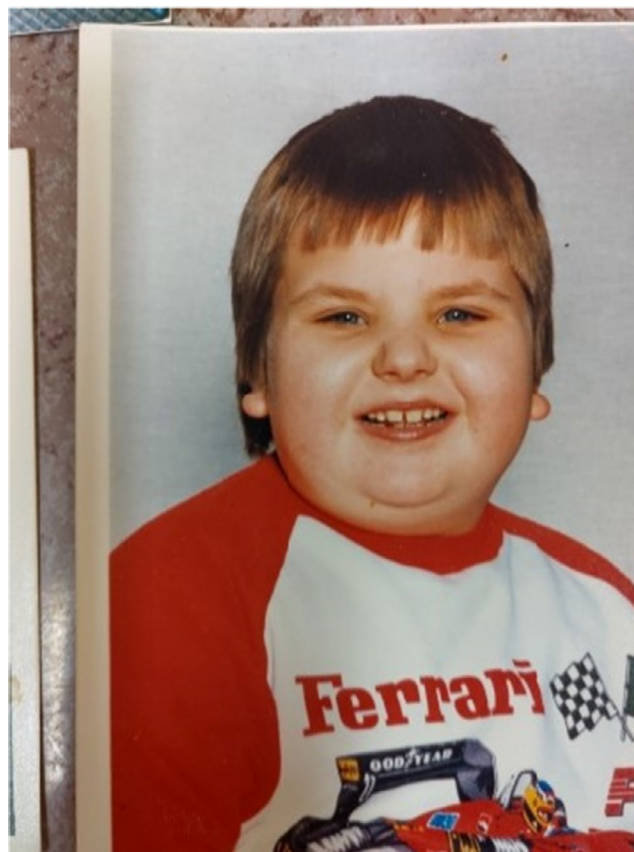
FIGURE 1 Patient at the age of 3 years

half-sister has a mild ID of unknown cause. The patient was born after an uncomplicated pregnancy by cesarean section. His birth measurements were normal, weight being 4230 g (+1.3 SD), height 51 cm (+0.3 SD), and head circumference 37 cm (+0.6 SD). At the age of 5 months, a slight systolic murmur was recorded.