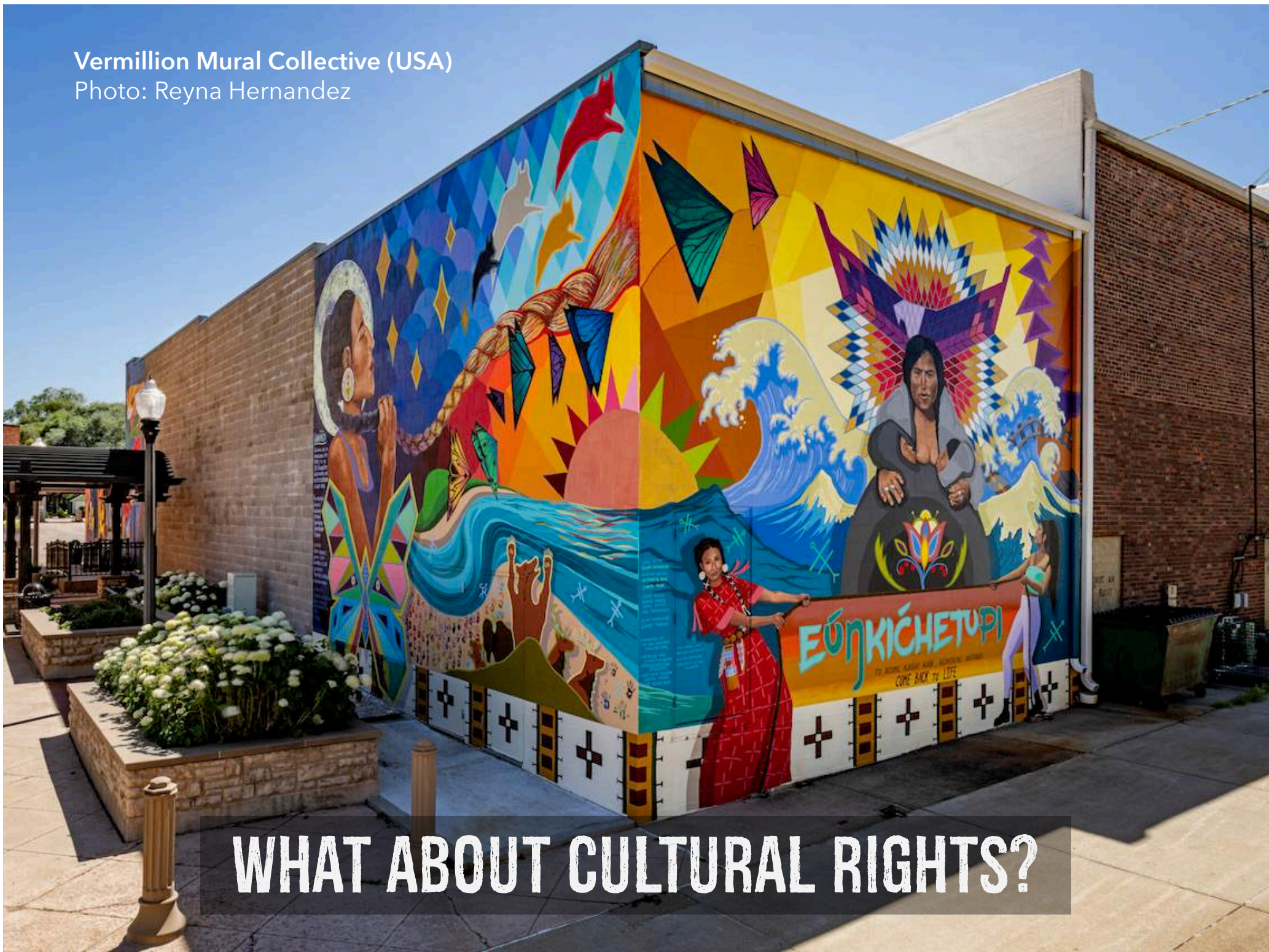
Vermillion Mural Collective (USA)