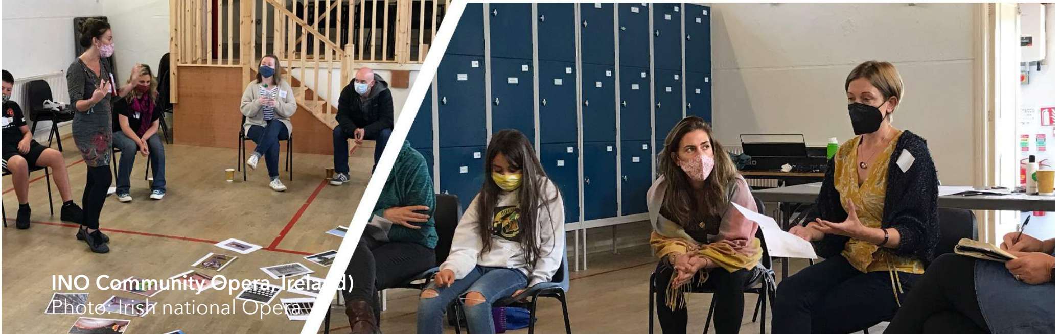
INO Community Opera (Ireland)