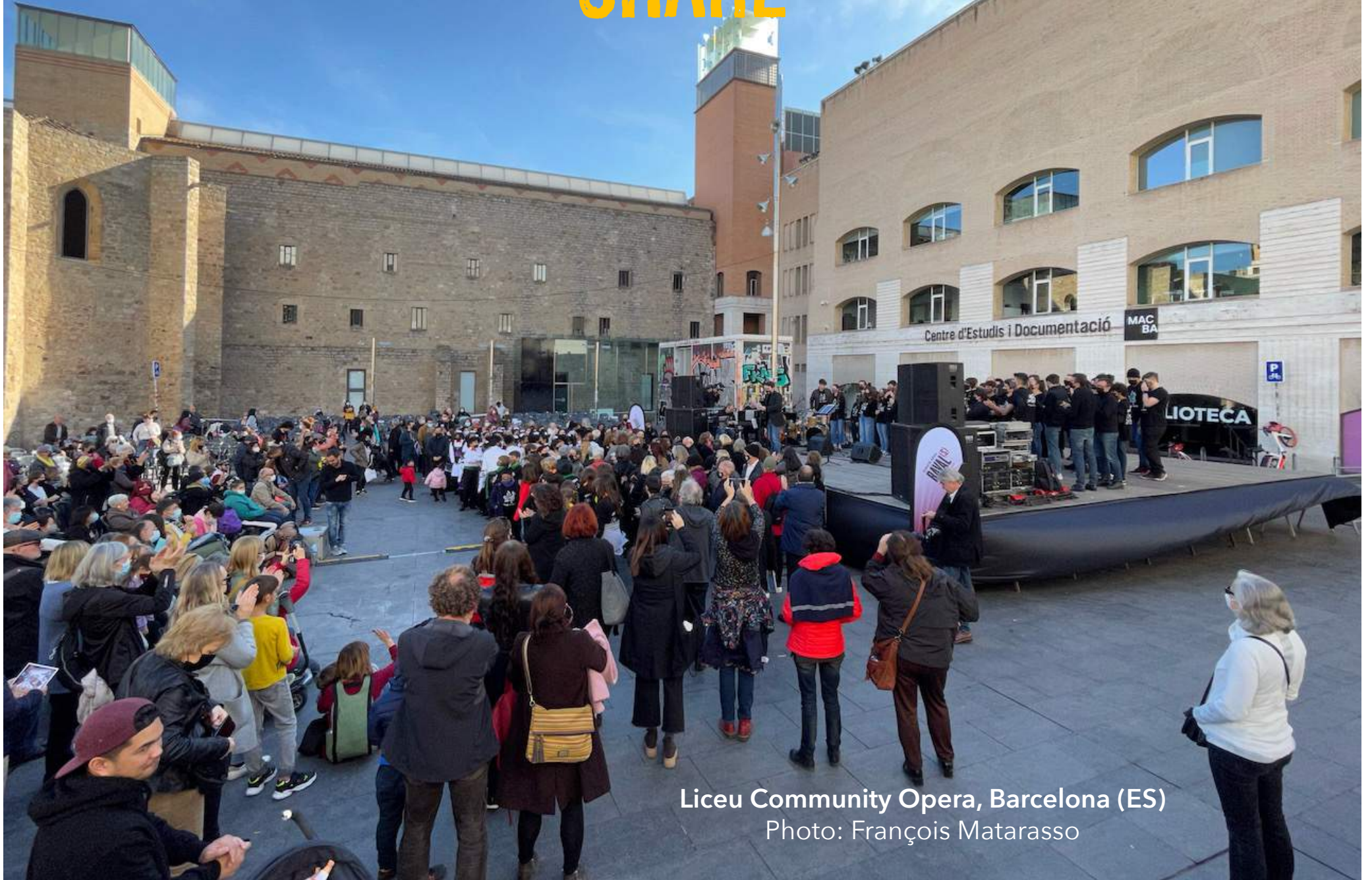
Liceu Community Opera, Barcelona (ES)