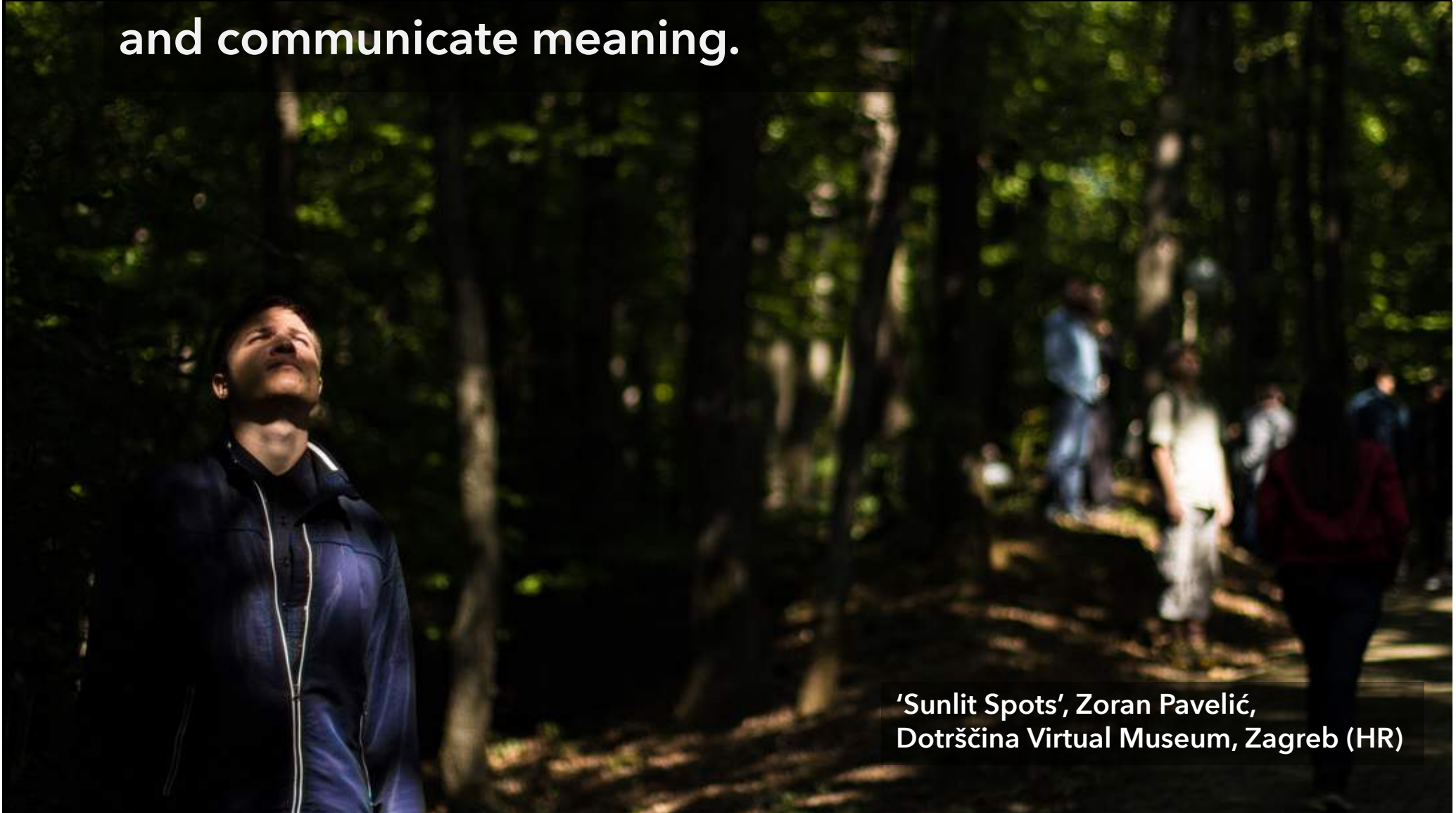
'Sunlit Spots', Zoran Pavelić, Dotrščina Virtual Museum, Zagreb (HR)

The artistic act intends to create and communicate meaning.