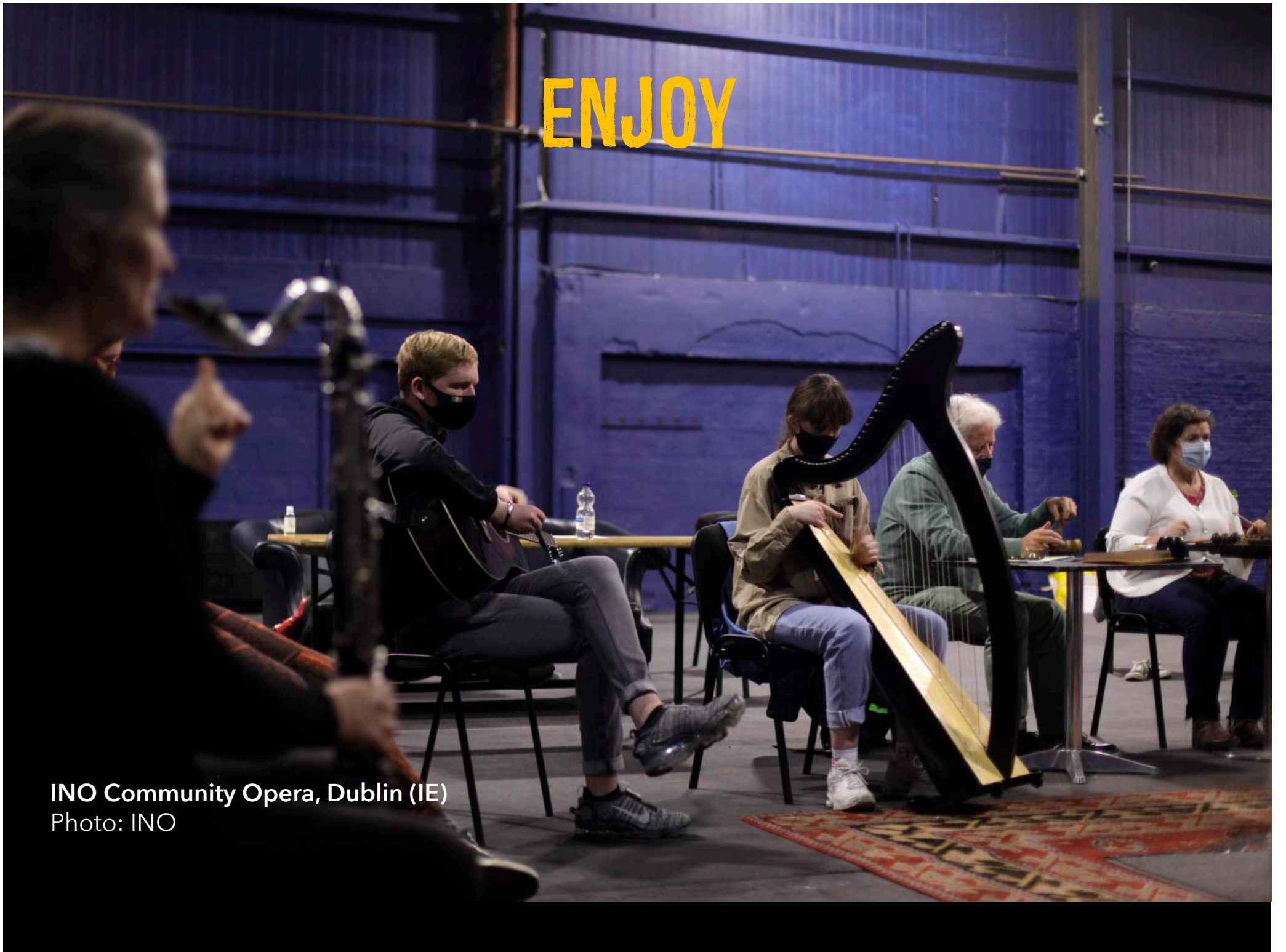
INO Community Opera, Dublin (IE)