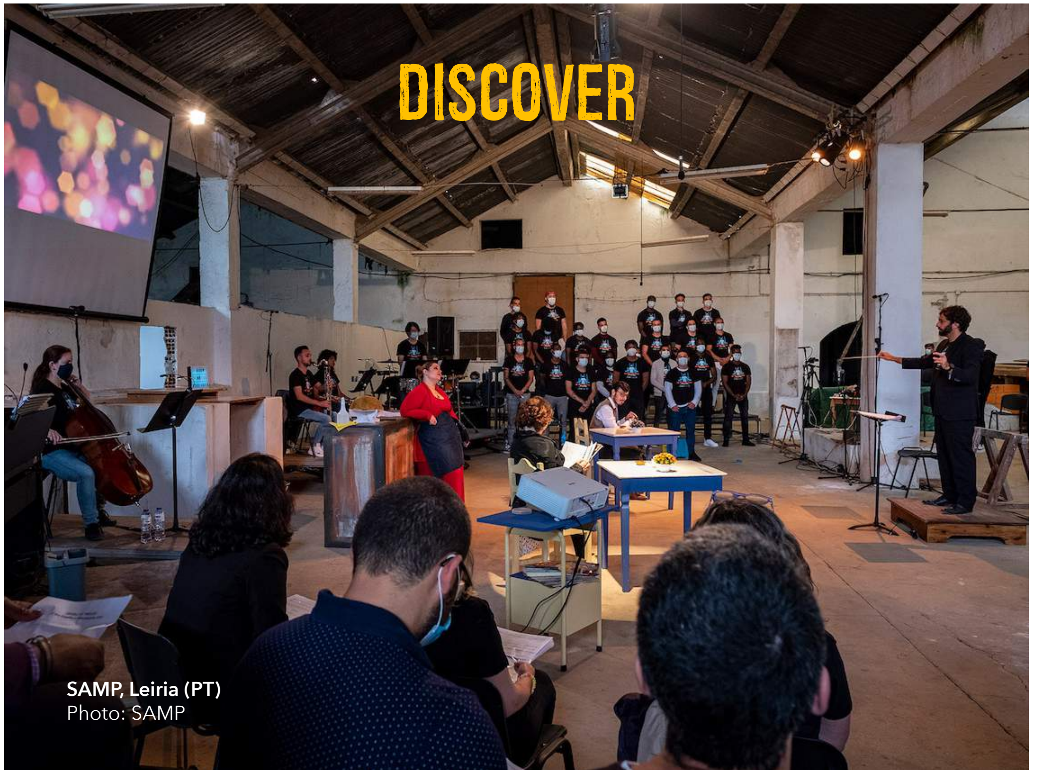
SAMP, Leiria (PT)