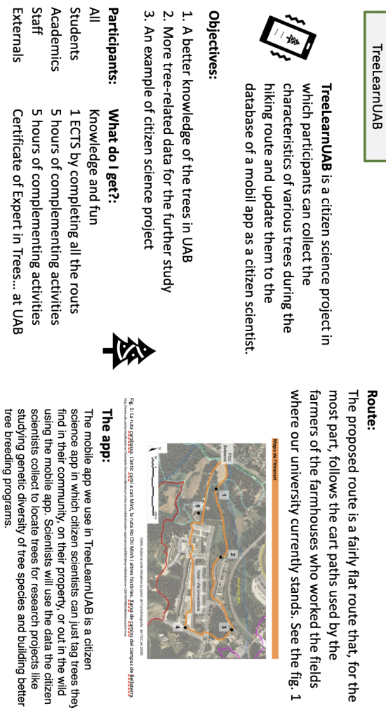
Fig. 2: TreeLearnUAB