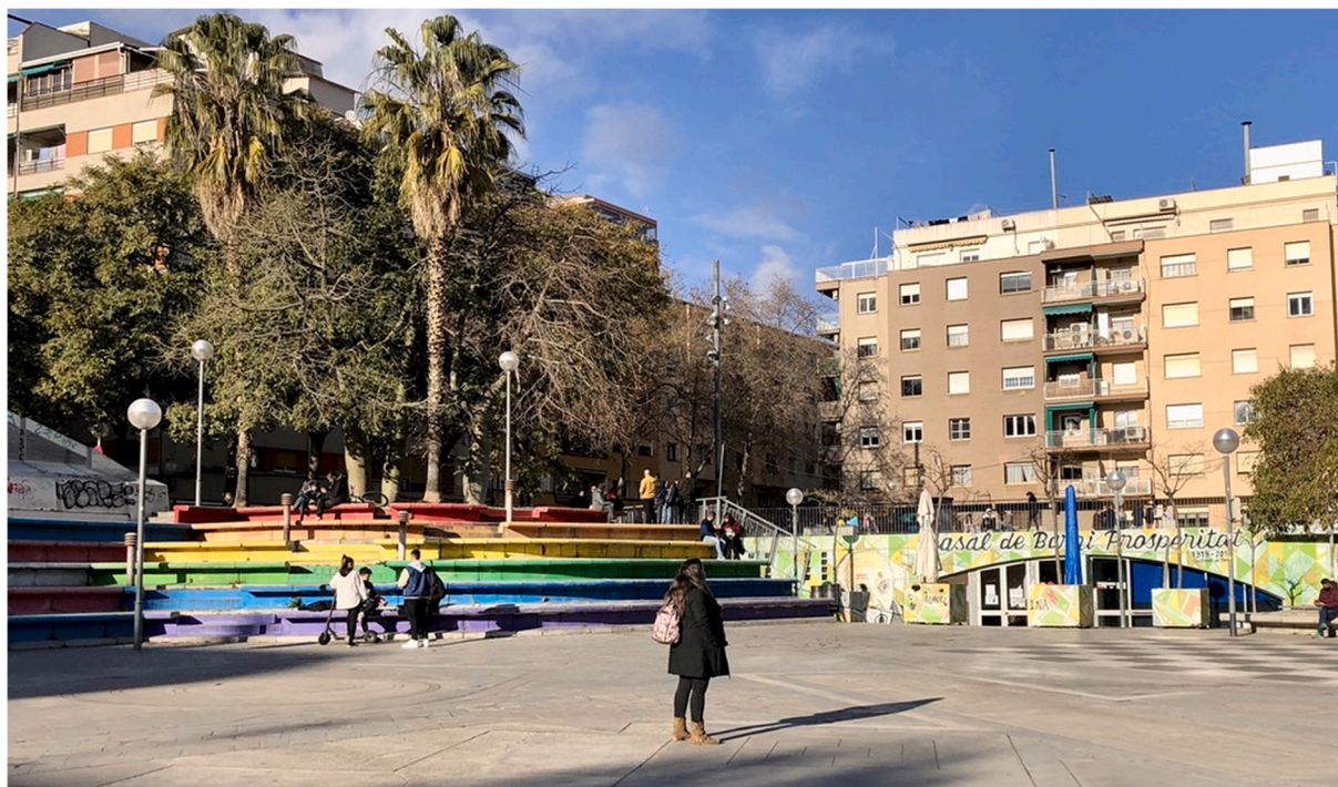
Fig. 4. Plaça Angel Pestaña, a hard-paved square at the center of the neighborhood and the Casal de Barri Prosperitat in the background, which concentrates much of the local cultural and civic activities (author's own photo).