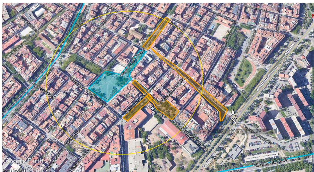
Fig. 3. Proposed areas for the implementation of the Climate and Care Refuges (in orange), covering a 200-m radius in relation to the Plaça Angel Pestaña (in blue). It connects schools, high schools, civic centers, retirement homes, a primary health center, a sports pavilion, churches, a mosque, and several shops and supermarkets (Diagram: Collectiu Punt 6, Google Earth, 2019). (For interpretation of the references to color in this figure legend, the reader is referred to the web version of this article.)

Looking at additional experiences, Kansas City, Missouri, in the United States presents an example of a district-wide revitalization initiative, with the creation of a “Green Impact Zone” in which a declining district was transformed into a thriving and sustainable area with improved housing, community services, health and employment programs (BCNUEJ, 2018). In the United Kingdom, Bristol has developed innovative ways to address social and environmental inequalities with the requirement of an “Equalities Impact Assessment” for all new policies, striving to develop integrated green infrastructures and public amenities that address the specific needs of vulnerable groups (ibid.). These interventions point to innovative strategies and approaches that foster neighborhood revitalization and greening while preventing displacement and gentrification, with a particular focus on vulnerable groups.