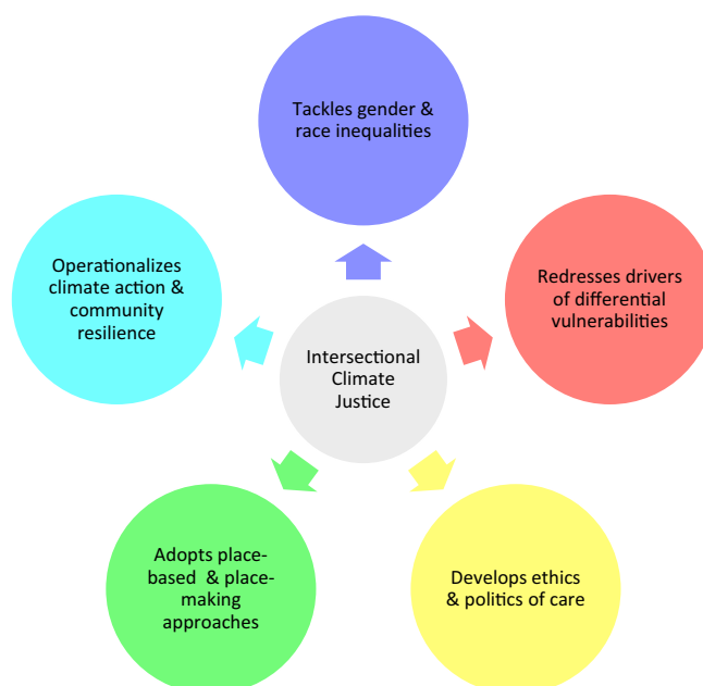
Fig. 2. Intersectional climate justice: a conceptual framework for urban adaptation planning.

These deeply embedded injustices of historic racism and sexism are reflected in contemporary communities' capacity to cope with and adapt to climate change. There is growing recognition that the impacts of climate change have a disproportionate effect on women, Black, Indigenous, and low-income communities (Costello et al., 2009; IPCC, 2012). Research has shown that these groups tend to be more vulnerable to the effects of climate change because they are less likely to own land and resources, have less education and training, less access to institutional support, health services, and information, and fewer opportunities to participate in decision-making (Alston and Whittenbury, 2013; Denton, 2002; Nelson, 2012; Röhr, 2006). Despite that, we do not suggest that intersectional climate justice calls for reproducing simplistic portrayals of poor, Black, and Indigenous women as the main victims of environmental degradation while at the same time reinforcing a narrative that they have greater environmental awareness (Johnsson-Latham, 2007), positioning them as 'eco-warriors' (Resurrección, 2017), and community leaders towards resilience (Enarson, 2013; Veuthey and Gerber, 2012). Such a simplified approach to underlying race and gender inequalities attributes yet another responsibility to the already long list of caring roles. Rather, an intersectional lens pushes back against reductionist narratives to the extent that they