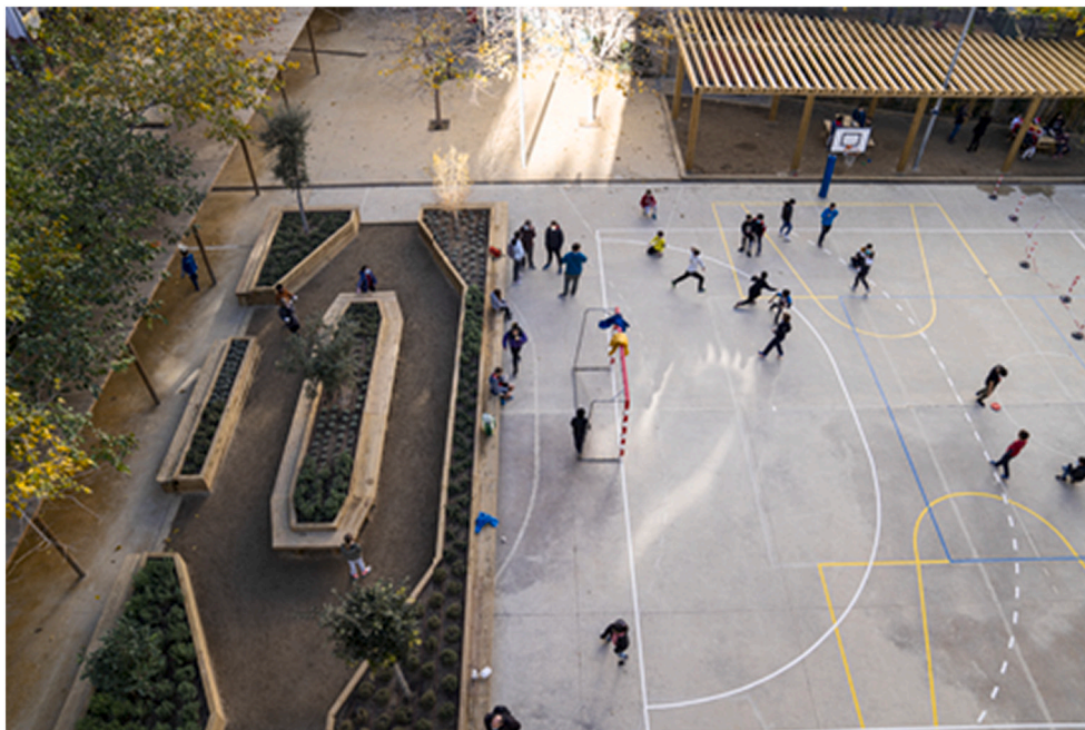
Fig. 5. Courtyard of a school which underwent the project “Refugis Climàtics a les Escoles” in Barcelona, where one can see new green interventions (vegetation and shading). (For interpretation of the references to color in this figure legend, the reader is referred to the web version of this article.)

In one year, the pilot project transformed eleven schools into climate shelters, replacing 1000 m 2 of concrete with soil and vegetation, adding 2213 m 2 of new shaded spaces with pergolas and awning, planting 74 trees and installing 26 new water points.