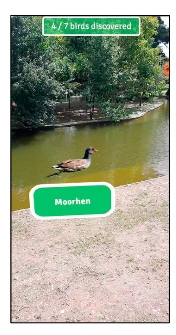
(c) Virtual bird in the scenario.

Fig. 3: Augmented reality experiences. Finally, the app also collects authorized demographic data of the visitors and specific data associated with the