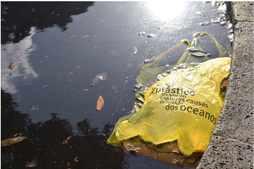
FIGURE 1. Is this our future? (Nacional Photography Contest 2019/20)

As repeated throughout the Project, it values the participation of each student, each group of students, each school, in an effort to contribute to more sustainable communities. However, stimulating the quality of student participation, since its foundation, competitions for the best projects at national level have been held. In 2017/18, this national competition was interrupted, as the dispute between students / schools is not an objective, but was resumed in 2019/20, due to requests from students and teachers. Alongside a national competition for student projects, since 2014/15 thematic contests have been held for photography (the first to be implemented), video, text, drawing and advertising spot (this one since 2018/19). With them, it is intended to value resources that students build (who go out on the street, photograph, make videos, write about their experiences) and encourage the participation of students with different skills. These contests have an increasingly central place in the Project and, through them, younger people bring very clear messages about the problems they identify (Figure 1).