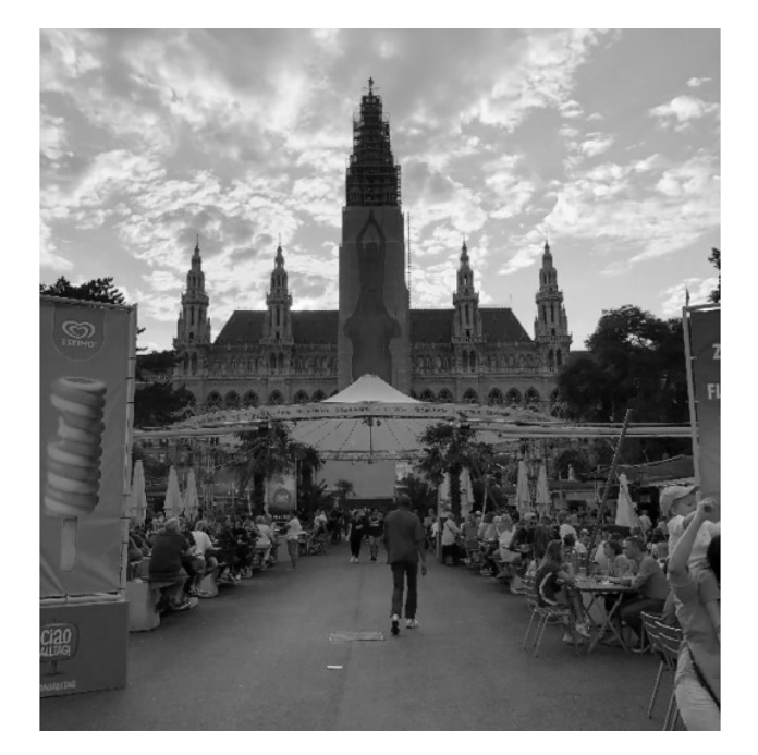
Fig. 9. Street art performance and commercial space in front of the city hall of Vienna, Austria

Street art also drives other business opportunities for the city, and a cultural industry chain will form behind it. For example, some manufacturers selling audio equipment, because of the popularity of street art, the number of sales will gradually increase, bringing economic growth. There are also consumables for other performance items, for example magic props, painting and handicraft consumables, etc., which have brought economic growth (Fig. 9) [11].