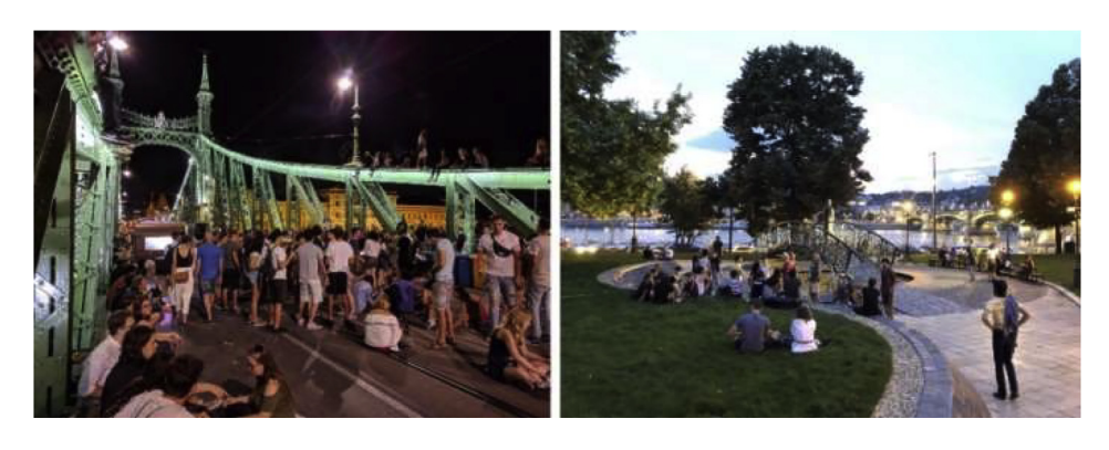
Fig. 3. People communicating and interacting in urban public space of Budapest

urban public space, but also an art method that is easy to be recorded and disseminated by modern tools.