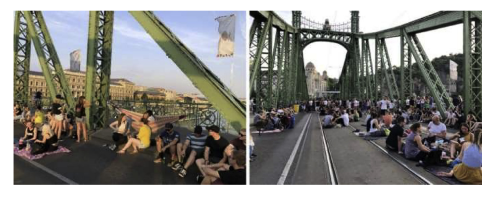
Fig. 6. People different leisure ways on the Liberty Bridge in Budapest

For street performers, a good venue is the key to success. Reasonable public space layout can create favorable conditions for street art to intervene in urban public space, increase the income of artists, and at the same time allow audiences and artists to interact better. The spatial characteristics of the venue will also influence the choice of street