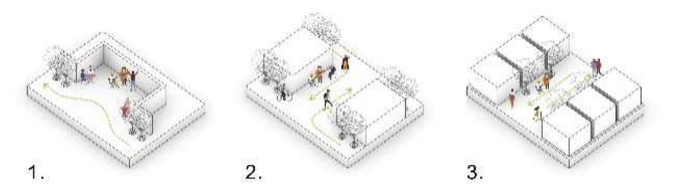
Fig. 8. There are different choices of street art performances in different urban public spaces; 1. Performance in semi-open space; 2. Performance in public space combined with transportation; 3. Performance in urban street space

Street art on the development of the surrounding business has a stimulating effect, urban public space for the audience