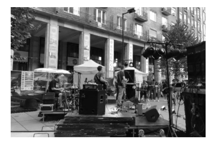
Fig. 2. Filmed in a square space in Budapest

In today's society, people will create shared spaces where more people can participate and interact according to their lives and learning styles. These new types of urban public