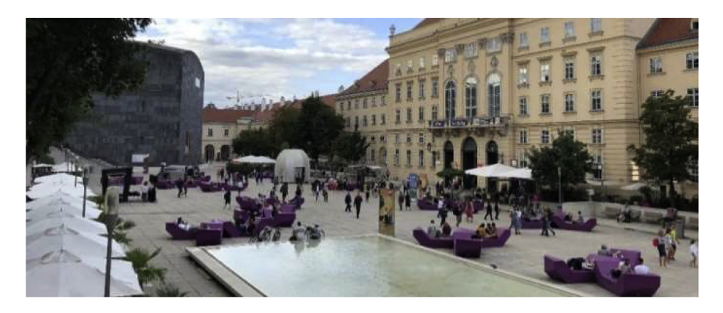
Fig. 7. Seating units in the Vienna Museum District in Austria