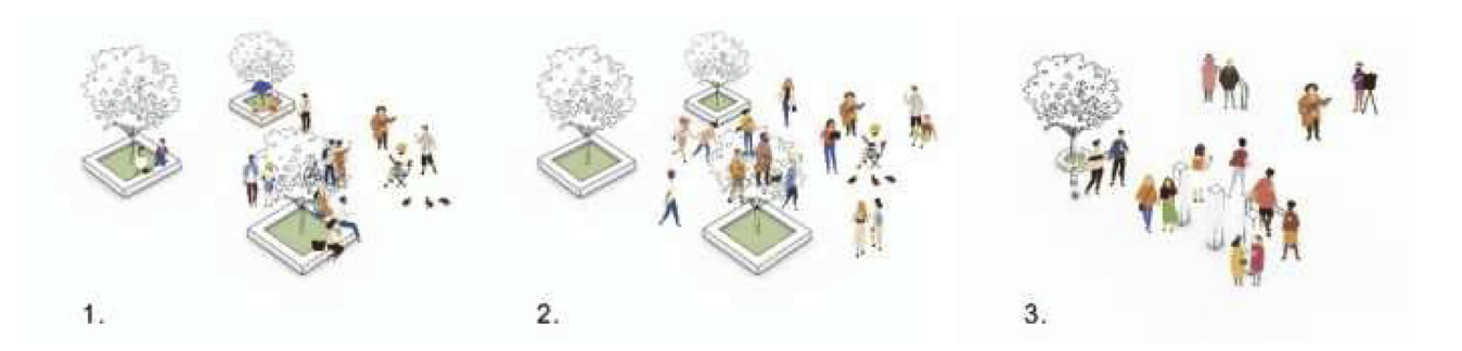
Fig. 5. Street art-induced behaviors: 1. sitting facing the artist; 2. standing with staggered eyes; 3. like to rely on objects

leisure in this space. People can hang a hammock in the space of the Liberty Bridge, spread their own carpets on the ground, etc. (Fig. 6).