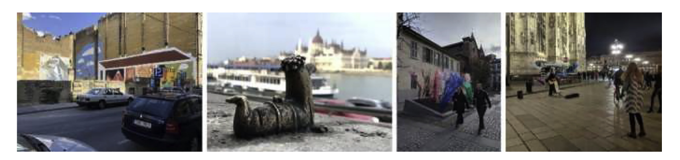
Fig. 1. Graffiti, creative jewelry, street art performances in urban spaces

A Chinese scholar, Ms. An Linli, pointed out in her paper [3] the four characteristics of street art, in namely "mobility", "cultural", "spontaneity", and "aggregation". The article also pointed out that street art refers to the best skills for street performers for example musicians, painters and performance artists to perform for the public in public places, including singing, dancing, musical instrument performance, painting, juggling performances, storytelling, and other performance forms. The street art defined in this article has the characteristics of "flowability", "ornamental", "participation", and "culture". First, the place where street art takes place is urban public places like "street", due to the public attributes of a place, its occupation of space is usually temporary and changeable, and so it has considerable mobility. Secondly, street art should be ornamental. The level of performing arts is the core rule for determining whether it is called an "entertainer" (Fig. 2). Street art itself is an art culture, which has the role of cultural dissemination while being appreciation. Finally, the appreciation nature of street art has brought about its participation different from groups for example beggars, tramps, etc. [4]. The need to attract the attention and participation of passers-by during the performance is the prerequisite and basis for communication and interaction.