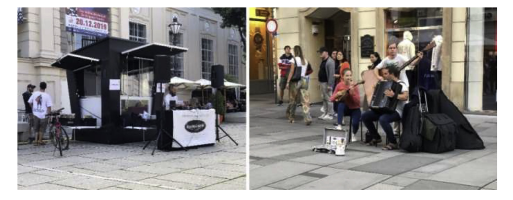
Fig. 4. Street art event in urban public space in Vienna, Austria

Different forms of street art will induce different usage behaviors in different types of urban public spaces. For example, a weekend street art event party on the Liberty Bridge in Budapest, the bridge's main transportation space. Liberty Bridge forms a venue for street art weekends through a temporary function replacement strategy. The free and joyful atmosphere allows people to choose different ways of