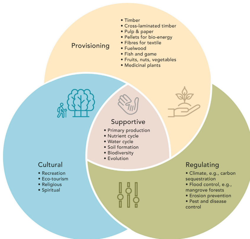
Figure 1. General categories of forest ecosystem services following the classification of the Millennium Assessment, with examples

on the activities of stakeholders at each scale. For example, it is not enough for stakeholders in a community surrounding a forest management unit, such as residents, managers, workers, visitors, and local businesses, to be aware of the impact of certain stresses of change on “their” forest and its ecosystem service potential; only when they process information on the stresses, know about appropriate responses, and have the necessary capacities, skills, and assets 17 will they be able to adapt forest structure and dynamics to make the forest more resilient. 36 Building resilience in the forest sector at all hierarchical scales along the FESSC requires an upstream effort along the value chain so that resilience thinking and actions permeate the entire cascade. Figure 2 visualizes the downstream and upstream cascading effects on the supply of the ecosystem service, here referred to as the Cascade. The Cascade is inspired by the stakeholder-oriented conceptualization