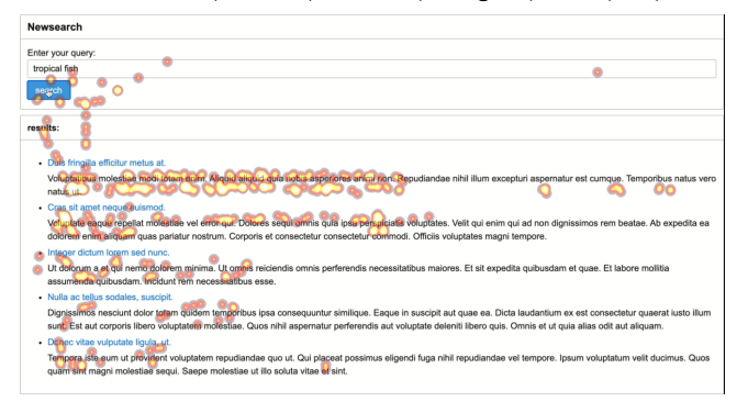
Figure 2: Heat map of mouse interactions overlaid on top of an image of a search interface captured using the screen recording functionality of Big Brother.