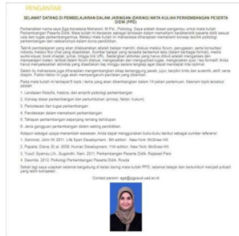
Figure 6. The Display of Student Development Course on the E-Learning Website

To maintain the quality of digital modules that are developed, as planned there needs to be a validation of experts who will assess the digital module on Student Development and Introduction to Biotechnology.