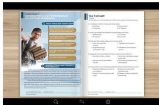
Figure 3. Digital Module of Student's Development Course

By using the Flip PDF Professional application, a Digital Module has been prepared for the students' development course. The modules that have been prepared are equipped with several learning videos so that the modules are more interesting and not monotonous. Display one of the pages in the digital module for student development course or abbreviated as PPD ( Perkembangan Peserta Didik ) is as follows.