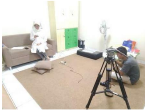
Figure 4. Taking Video For Student’s Development Course Description

By using the same application, a Digital Module for Introduction to Biotechnology Course has been prepared. The modules that have been developed are as follows.