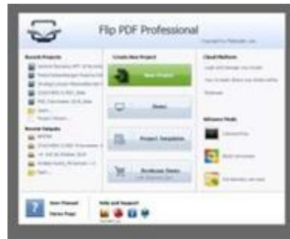
Figure 2. Flipbook PDF Professional Display