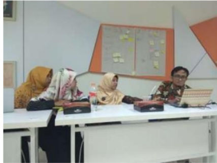
Figure 8. Validator Reviews the Prototypes

The results of validation in the Focused Group Discussion conducted, there are some input and suggestions from the validator shown in Table 4 as follows.