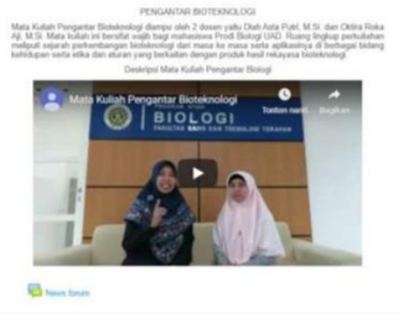
Figure 7. The Introduction to Biotechnology Course on the E-Learning Website

To maintain the quality of digital modules that are developed, as planned there needs to be a validation of experts who will assess the digital module on Student Development and Introduction to Biotechnology.