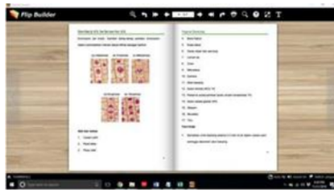
Figure 5. The Display of The Digital Module for Introduction to Biotechnology

By using the same application, a Digital Module for Introduction to Biotechnology Course has been prepared. The modules that have been developed are as follows.