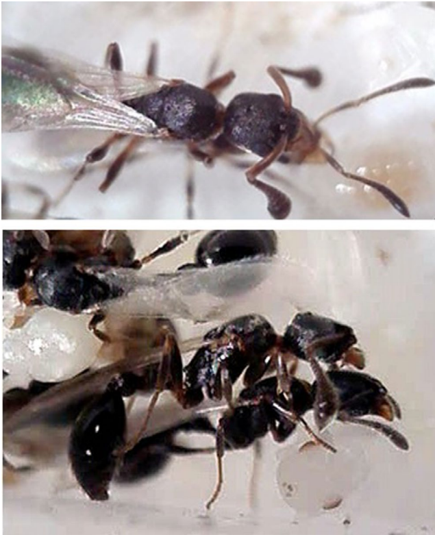
FIGURE 1 Male of the ant Cardiocondyla zoserka trying to copulate with a winged female sexual. In the upper figure, the position of the cup-shaped antennal tip relative to the head of the female sexual can be seen; the lower figure shows that the male has extended its genital appendages, which are normally retracted and concealed

very broad and strongly concave. The apical segment is invaginated and forms “a cup-shaped hollow which extends deep into the segment” (Bolton, 1982). All funicular segments are covered by numerous sensilla. A closer inspection revealed heavily sculptured areas with numerous invaginations on the ventrodiscal side of funicular segments 7–10 (Figure 2a), with their number increasing from the 7th (about 10 invaginations) to the 10th funicular segment (about 60 invaginations). Similar modifications of the cuticle could be seen on the ventral, proximal surface of the cup-shaped apical segment (about 40 invaginations), which therefore superficially resembles a skimmer spoon (Figure 2a,b). Scanning electron microscopy of the invaginations suggested rests of secretions in some of them (Figure 2c) and also revealed a very finely striate microsculpture in the inner surface of the apical cup (see figure in Heinze, 2020).