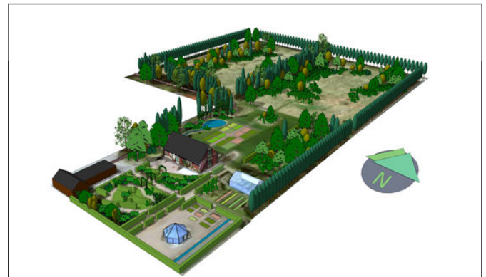
Figure 1: Alnarp rehabilitation garden illustration by Gunnar Cerwén.

Research at SLU in Alnarp has identified eight basic Perceived Sensory Dimensions (PSDs) in garden and nature areas. Together, these eight dimensions could define a spectrum of multisensory experiences, of sight, hearing, smell, taste, touch, temperature, proprioception and balance, which could offer good conditions for a multimodal treatment (Stoltz and Grahn, 2021). Alnarp Rehabilitation Garden was designed to contain all eight PSDs [9]. The garden also contains a gradient from de-stressing and relaxing parts for rest and contemplation to active and challenging parts, with cultivation and social activities (Figure 1).