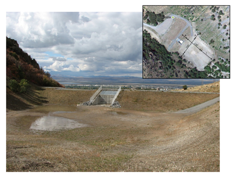
Fig. 3 Images of the dry canyon detention basin. Note. Looking west out of the mouth of the Dry Canyon detention basin (main). Aerial view of the Dry Canyon detention basin (insert)

In August of 1977, a rather unusual rain event occurred near the city of Logan, Utah, which is located on the western edge of the Bear River Range, a northern extension of the Wasatch Range in the Rocky Mountains of the United States. Approximately 4 in. (100 mm) of rain fell in this area in less than 12 h, a rainfall record that has yet to be broken. As a result of this rain event, homes were flooded when a flash flood occurred in Dry Canyon, a small and rather steep valley without a perennial stream. However, despite this past flood, increased urban growth in the 1990's and 2000's resulted in multiple homes being constructed near the mouth of Dry Canyon. To protect these homes, a detention basin was constructed at the mouth of Dry Canyon in 2008 (Fig. 3). A large stormwater drain was also constructed to carry outflow from the detention basin to Logan River. The HDC module was developed as a case study of the design of the detention basin and stormwater drain at the mouth of the Dry Canyon watershed. There