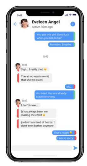
Figure 6. Each message is colored to indicate its sentiment

Emojis were adopted more frequently in response to recognizing how text is limited in communicating the sender's intentions. If a user can have a better understanding of another's sentiment in a text-based communication, miscommunication can be reduced. Nowadays, it has become possible to estimate a sender's intention using machine learning and NLP (Natural Language Processing) model. A text messaging