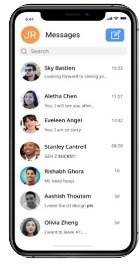
Figure 3. Generic design