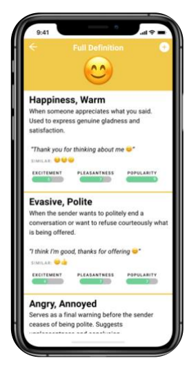
Figure 4. Emoji Dictionary. Each definition (from top) has its summary, detailed definition, example usage, similar emojis, and scores

Facebook Messenger, two popular messaging platforms. Moreover, many of the design choices were made after being inspired by how each application implemented its features. As for specific features, we have designed a possible variation of emoji dictionary, sentiment analysis, and text manipulation. The designs were made through Figma, an online collaborative UI/UX design platform. We chose Figma for its capabilities, features, and affordability to students. In addition, Figma enabled us to add contemporary animations with our features, which provided a more immersive user experience when participants interacted with the mockup.