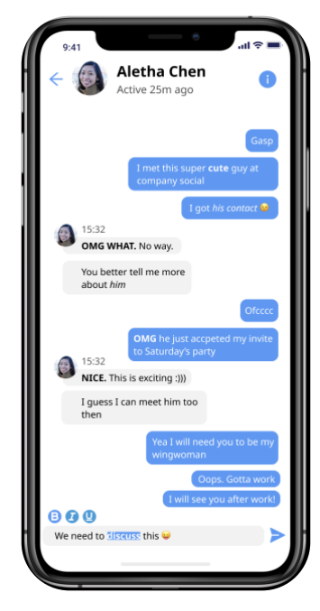
Figure 8. Rich text formatting applied to messages and the user is seen bolding "discuss"

Miller et al. have pointed out the minuscule effect of accompanying text in clarifying the intention behind emojis' usage. We suspect that a potential reason behind this phenomenon is the lack of ability for users to manipulate text. It is common in modern literature for the author to manipulate the text (i.e., bold or italicize) to emphasize its intention and meaning. We think text manipulation can be useful in reducing miscommunication. In our mockup, users can highlight specific words in their text and have the option to applies rich text formatting (bold, italicize, and underline). By applying text formatting, a sender can provide more cues for the receiver to understand their intention. In our study, we asked participants questions that gauged the effectiveness of rich text formatting in text messaging.