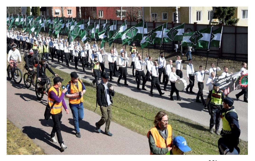
Figure 5. A May 2017 NRM demonstration in Gothenburg<sup>351</sup>

internet to coordinate propaganda, tactics, and fundraising with like-minded groups across Europe and North America.<sup>350</sup> Figure 5 depicts a NRM march that was supposed to process near a synagogue on Yom Kippur until Jewish advocacy groups bargained with Gothenburg's municipal court to reroute it away from the synagogue.