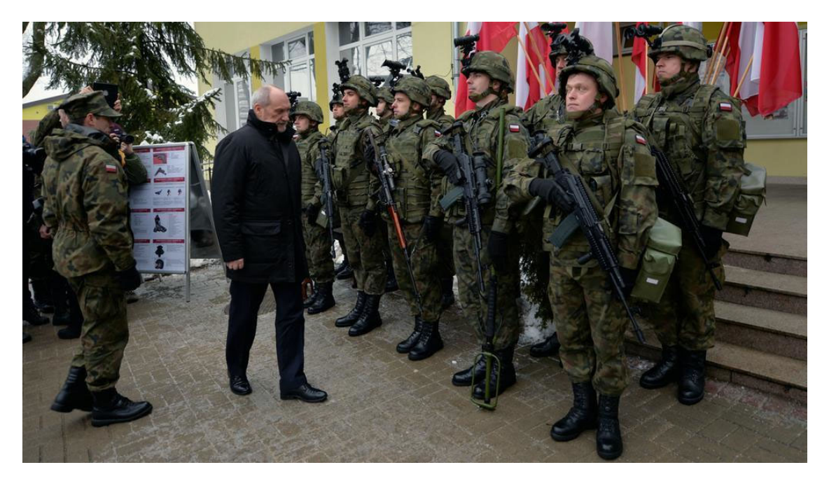
Figure 4. Defense Minister Macierewicz inspecting the Territorial Defense Force <sup>253</sup>

paramilitary culture in Polish society.<sup>252</sup> Figure 4 is a 2017 photograph showing the former Defense Minister Macierewicz onlooking WOT's new soldiers as part of the planned paramilitary defense.