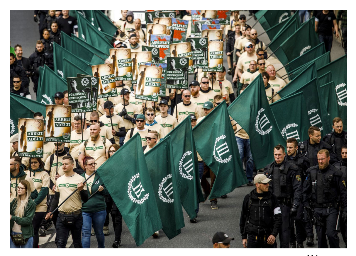
Figure 2. These Third Way marches are a common occurrence in the East<sup>116</sup>

recent incarnation was the Querdenker movement.<sup>115</sup> The Querdenker community's central effort was protesting Covid-19 restrictions and was analogous to the American QAnon community. These movements are more or less interchangeable as a vehicle for far-right activity. Figure 2 is from a 2020 march demonstrating the far-right Third Way's popularity in East Germany, reminiscent of the brown shirt SA style.