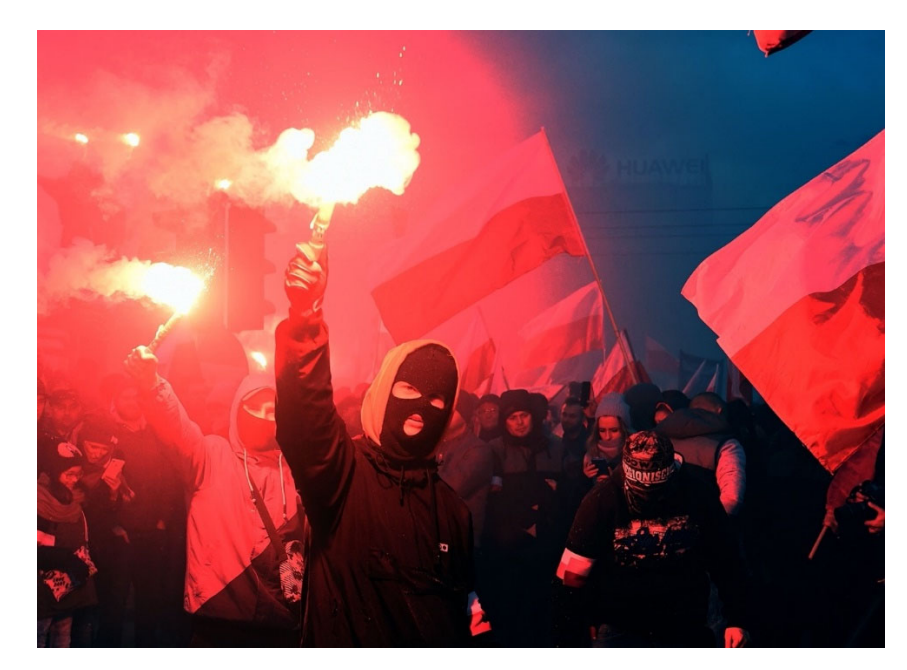
Figure 3. Interior Minister Blaszczack praised this rally as a "beautiful sight"<sup>225</sup>

broadcasted the PiS Interior Minister's comment that the crowd's patriotism was a beautiful sight.<sup>221</sup> A 2018 march through Warsaw witnessed a larger far-right demonstration with 100,000 people having attended.<sup>222</sup> The attendees chanted slogans like "Poland can't be red or rainbow, Poland must be nationalist!"<sup>223</sup> The marchers donned patriotic shirts with Polish Hussar cavalry while styling Poles and especially the far-right as Defenders of Europe.<sup>224</sup> Figure 3 shows a 2017 Polish independence day rally in Warsaw Polish far-right organizations typically promoted.